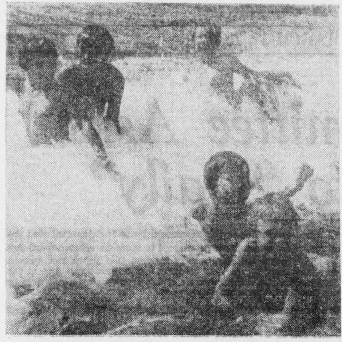
Workers children really live-where workers rule. Here is a group of happy youngsters, playing without race discrimination, on the shoof the Black Sea, Soviet Union. There is no unemployment there.