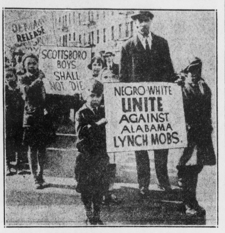
Harlem Workers, Negro and white, marching in protest against the legal lynching in Alabama.

A thunderous cheer goes up from the crowd at this point. Hathaway goes on and tells how the Commu-nist Party fights for all the oppressed, tells of the emancipation of the national minorities in the Soviet