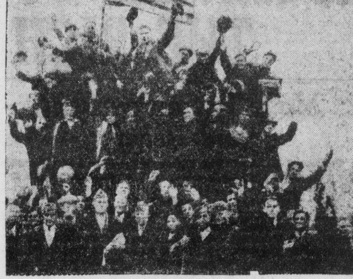
march to Washington to demand no cuts in disabled vets' compensation, and to demand their back pay (bonus).