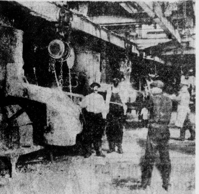
A typical scene in a giant mill, with workers feeding the roaring furnaces

on the steel code in Washington sche- tected him from attack. duled for July 31.