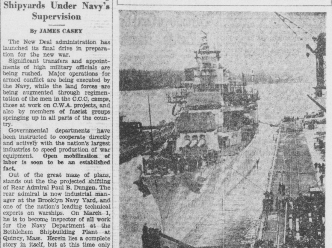
Launching another new battleship for use in defending the investments of Wall Street in China, Latin America, and Cuba. The Navy has received over $600,000,000 from the Roosevelt government in the last six months. Another $450,000,000 is being proposed in the present Congress, indicating the rapid preparations of the Roosevelt government for imperialist war.

word "emergency" is just a polite ably upon its request for a $500,- the contracts to be awarded for war-