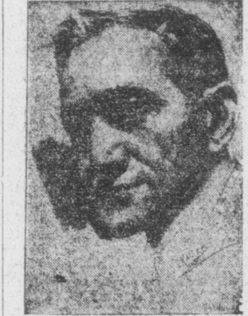
Secretary, Unemployed Councils

Thus the struggle against the real aims of the N.R.A. is the struggle for the right of the working class to live to get its rights. The outcome will be either Communism or fascism.