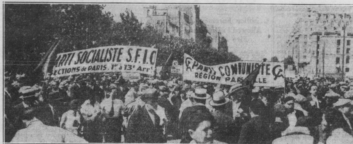
FRENCH WORKERS IN UNITED FRONT AGAINST WAR AND FASCISM Communists and Socialists of Paris united in a demonstration against war and fascism at the tomb of the Unknown Soldier under the Arc de Triumphe, in Paris, a few days ago.

There is not a Socialist worker or a Communist who will not be thrilled at the news that has just come from France telling of the final realization of a United Front agreement "in defence of labor and democratic liberties" against the menace of Fascism.