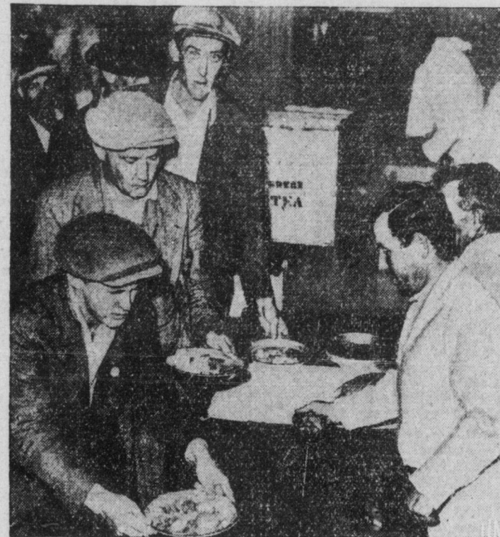
Food kitchens like these have been set up by the striking San Francisco workers. This one is in the Embarcadero, set up by longshoremen on the famous waterfront street.