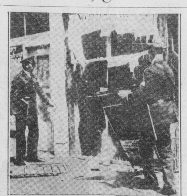
Photo shows police and "Vigilantes" wrecking the Finnish Cooperative hall in San Francisco as part of their campaign of terror against all working-class organizations. The press laid the basis for these raids on workers' halls, book-shops and clubs as part of the drive to break the General Strike in San Francisco. Despite the terror, the Communist Party is carrying on wide agitation against the bosses' attempts to strangle all organization in California,

Club. Tickets $1 on sale at 64 Second Ave, or at boat. OUTING to Prospect Park, Picnic Grounds, Sunday, July 29th at 2 p.m. Arranged by Unit 3, Section 17, C. P. Entertainment, refreshments. Milwaukee, Wis. PICNIC given by I. L. D. on Sunday, July 29th at 52nd and Parkside Ave. Markine Workers I n D Us Tr I A L Burhome Park. Take Car No. 50 going north. Picnic on Sunday, July 29th at Burhome Park. Take Car No. 50 going north. Picnic of the Radio and Metal Workers Local of the Radio and Metal Workers Local of the Radio and Metal Workers at Green Garden Farm, Featerville, Pa. 11 a.m. Take Wells No. 10 "West Allis" Take Somerton Bus at Frankfort and Arrott St. to end of line. Trucks will be there to take you to picnic ground.