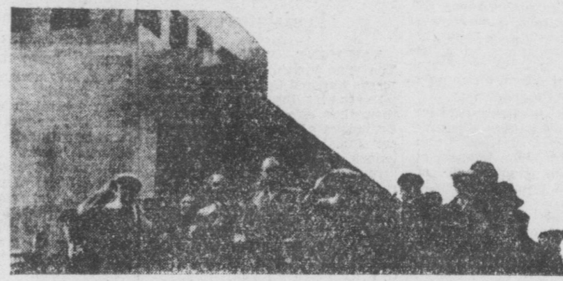
May Day in Moscow