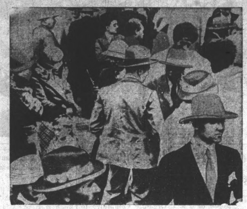
The railway station at Addis Ababa, capital of Ethiopia, has been crowded lately as foreigners fiee country, with which Mussolini has declared war to be inevitable. Il Duce casts a yearning eye on the nation's natural resources.

paying the veterans the bonus (their back wages) under the plea terests whose technicians formulated the War Department plans for the conscription of labor in wartime while guaranteeing industry a sizeable minimum profit.