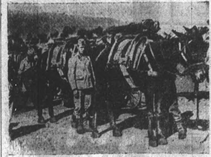
Italy's fascists are training troops to penetrate the fastnesses of Ethiopian mountains as preparations are being completed by Mussolin for an armed attack on the Independent Negro nation.