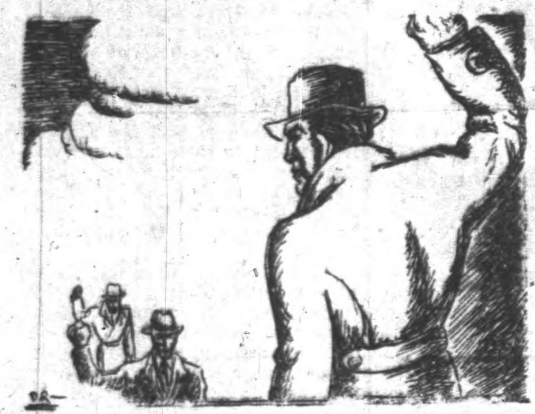
"He turned and lifted his fist in the Communist salute!

When darkness fell the Schieber changed his clothes completely. It was nearing eight when we stopped at a well-known health resort about thirty-five miles from the border. There was no sense in going any farther, since we were not expected at the rendezvous till the following noon.