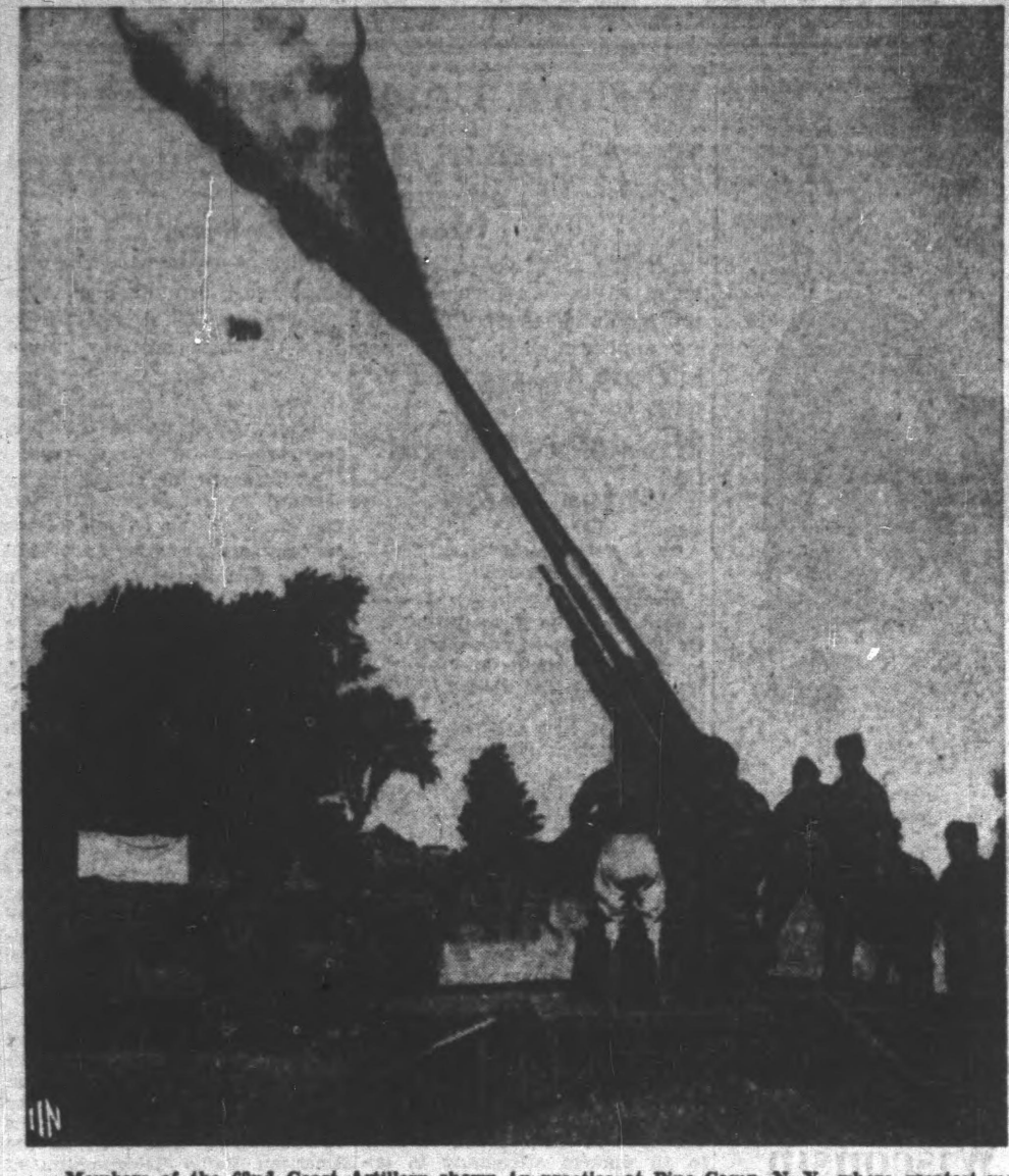
Members of the 62nd Coast Artillery shown in practice at Pine Camp, N. Y., where greatest maneuvers in nation's peacetime history are taking place. The Roosevelt administration is making ex-