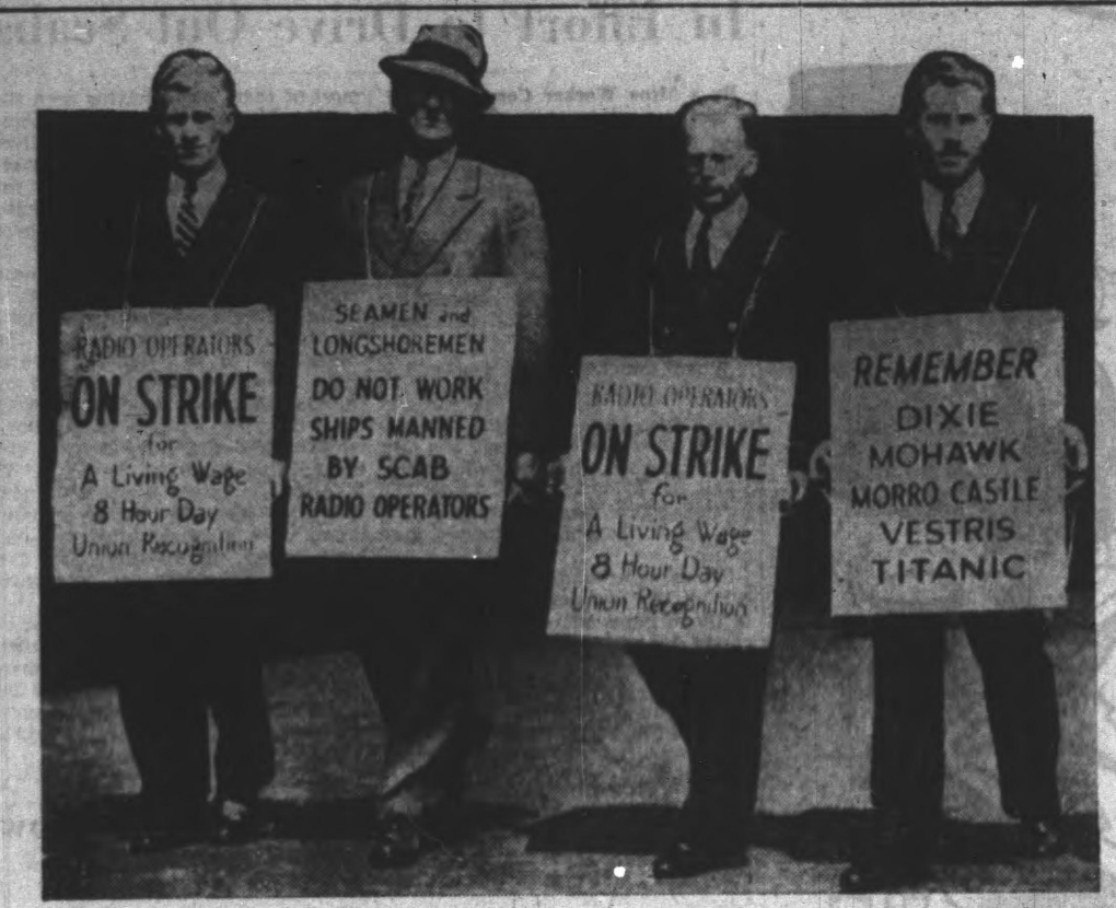
Striking steamship telegraphists tied up many ships last week in their demands for union recognition

RADIO OPERATORS PICKET AT NEW YORK PIERS