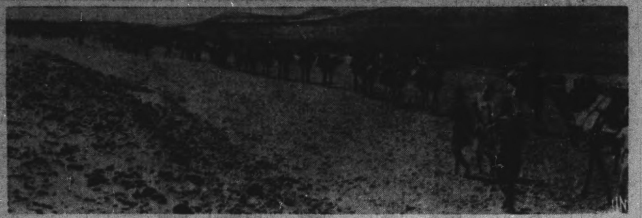
Here is shown a camel transport making the long journey through Italian Somaliland to the border with war supplies in preparation for the Fascist attack on the independent Negro nation. Emperor Sclassic has a nnounced he will mobilize 10,000,000 adults in defense of the country.

MUSSOLINI RUSHES MUNITIONS TO ETHIOPIAN BORDER