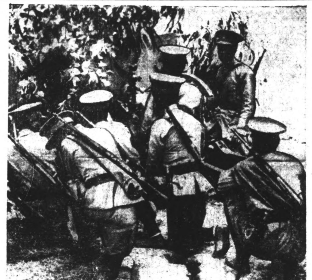
Behind a carefully camouflaged anti-aircraft gun, these artillerymen wait for bombers from the Italian lines.