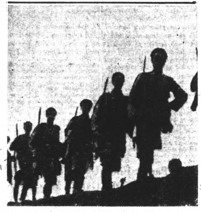
riors near Wel-Wal to meet the Italian fascist army. The picture was