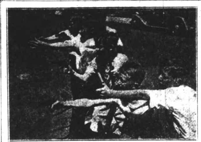
(Photo by Pierre Renne of children at play on the streets of Yorkville "Bang! Bang! Wooden guns, pop guns, toy machine guns, from under sheds, from behind garbage cans."