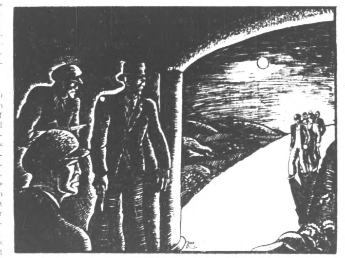
"GUNMEN WERE LAYING FOR THEM UNDER A BRIDGE."

labor to record his "impressions" of China d