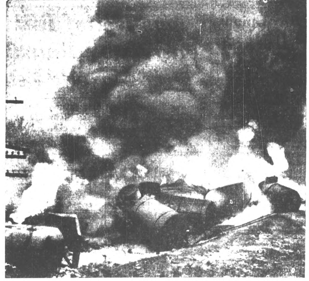
sumbled off the roadhed. One was ignited by a spark, and the resulting explosion set fire to the others