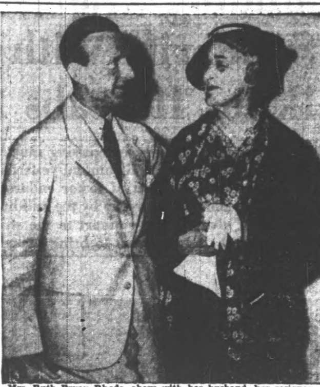
Mrs. Ruth Bryan Rhode, above with her husband, has resigned her post as American Ambassador to Denmark. It is reported that she will take an active part in President Roosevelt's re-election campaign.