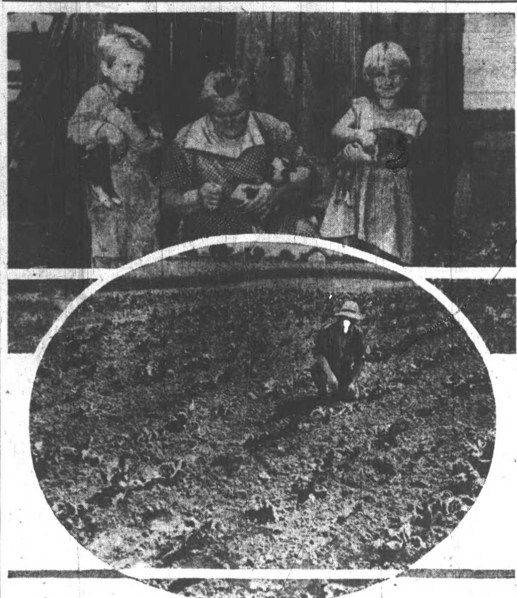
A farmer's wife (top), feeds a litter of pigs after the sow had died from the drought which continues to sweep the dust bowl with unabated severity. What should be a green field is reduced to stubble as the farmer (lower) surveys his desolate field.