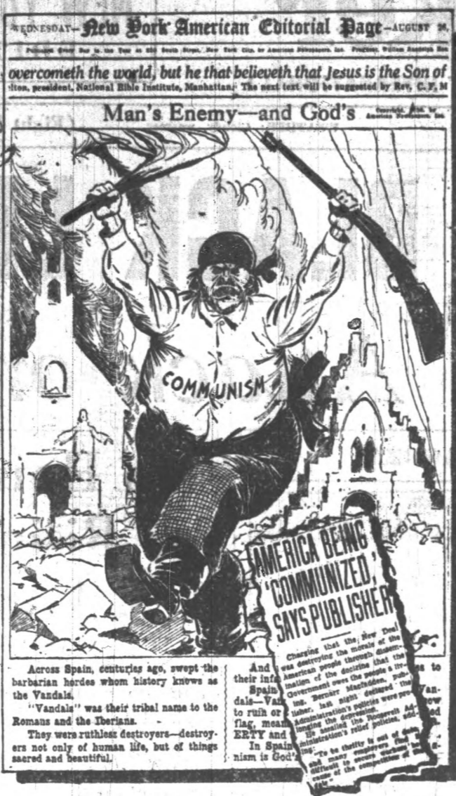
Across Spain, centuries ago, swept the barbarian hordes whose history knows as the Vandals. "Vandals" was their tribal name to the Romans and the Iberians. They were ruthless destroyers—destroyers not only of human life, but of things sacred and beautiful.

MILWAUKEE, Wis., Sept. 1.—The "Union" party, which calls itself "friendly to labor," refused flatly to hire union musicians for its picnic in Milwaukee, according to Musicians Union Local 8. The Lenke party had three bands, all non-union, and when the musicians union protested to the M.S. Duffy in charge of preparations, she flatly refused to hire union bands.