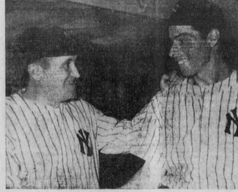
Manager Joe McCarthy congratulates Joe DiMaggio, who snapped Willie Keeler's mark, which had lasted since 1897, by hitting in his 45th straight game yesterday.