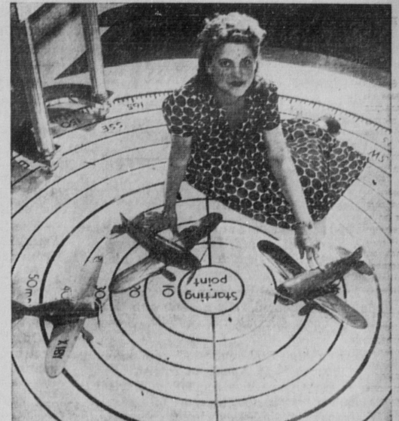
Ferries Warplanes: Miss Jacqueline Cochrane, noted American pilot, who recently piloted a bomber from Canada to England, is shown in her New York home after arriving by plane from Montreal. She left Britain twenty-nine hours earlier as a passenger on a return flight across the Atlantic.

"In the field of labor activity, political persecution is of course nothing new," they declared.