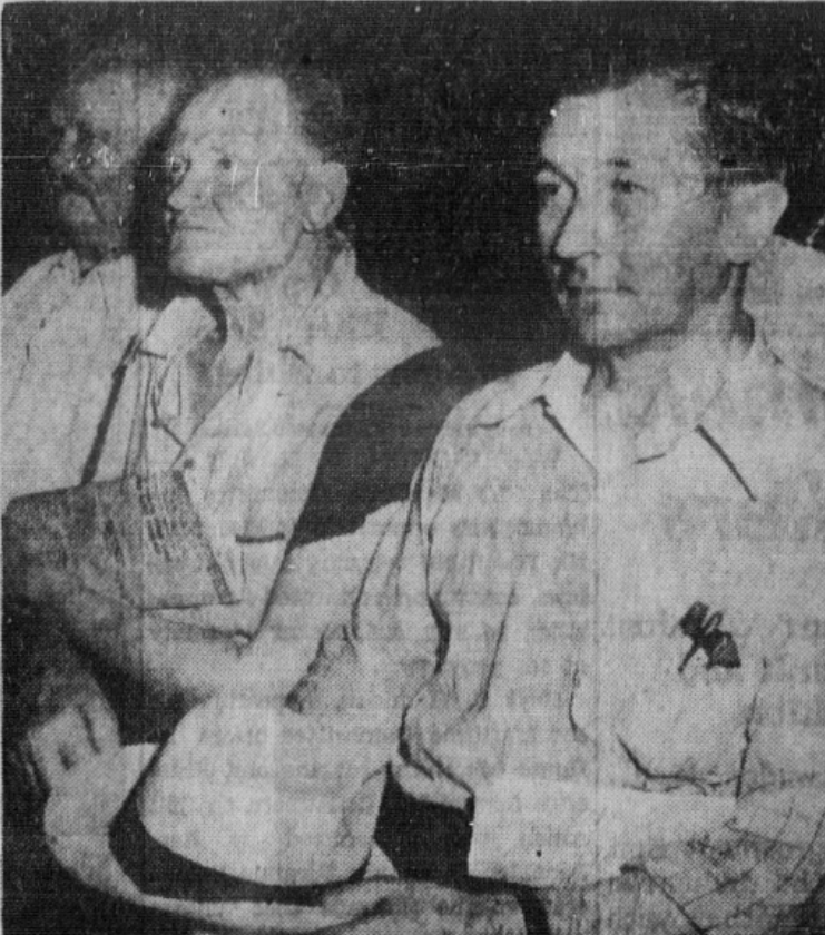
LITHUANIAN-AMERICANS shown above are part of the rally held in the Paradise Ballroom in Brooklyn last Tuesday night which urged President Roosevelt invoke the Lend-Lease Act for immediate aid to the British and Soviet peoples.