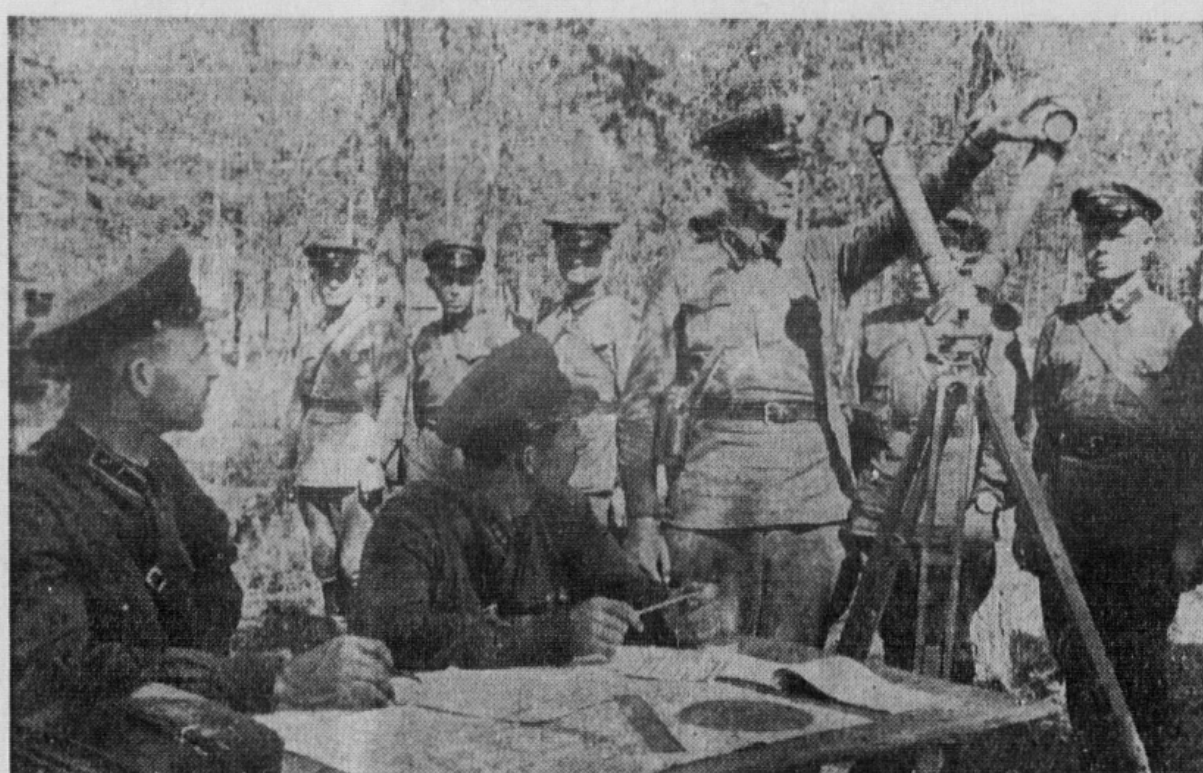
Red Army Training: Photo above shows soldiers of the USSR receiving instruction in the use of a modern army spyglass, used for observation of enemy positions. Red Army men receive training in the use of all up-to-date technical equipment needed for warfare today.

The root of past and prospective price increases lies in the control of prices by the monopolies. The point of attack therefore must be at this monopoly control. The attack will only be effective if it is waged by the unions and other organizations of the people.