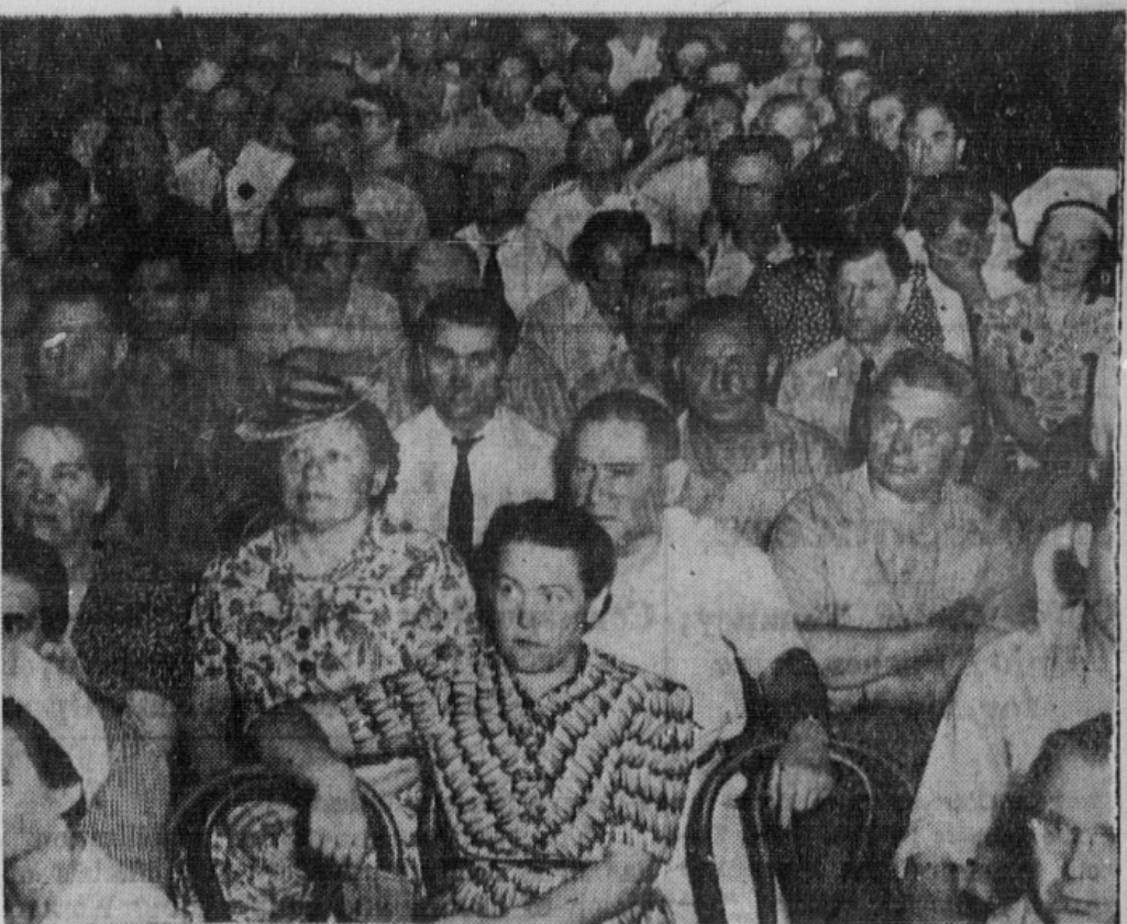
LITHUANIAN-AMERICANS shown above are part of the rally held in the Paradise Ballroom in Brooklyn last Tuesday night which urged President Roosevelt invoke the Lend-Lease Act for immediate aid to the British and Soviet peoples.