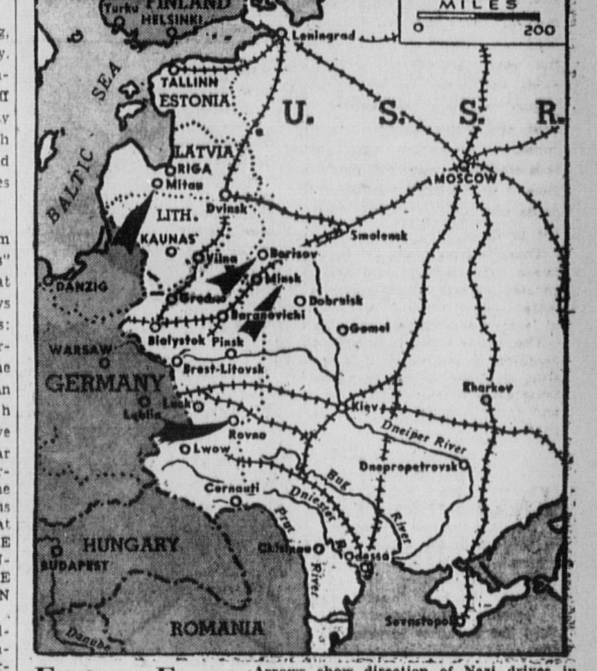
Eastern Front: Arrows show direction of Nazi drives in the war on the Eastern front.

As to the actual situation at the front, it might be summarized thus: