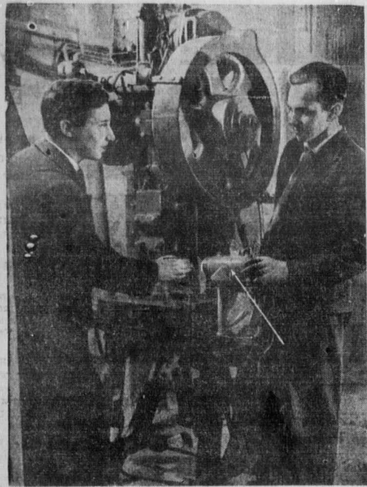
A New Soviet labor protective device is the invention of a photo-electric cell to eliminate the danger to a worker operating a die press or punch. This protective invention, the so-called 'electric eye' attachment is shown above by the arrow. As long as the worker's hand is in the danger zone, it is in the range of vision of the photo-electric cell, which keeps the machine at a standstill.