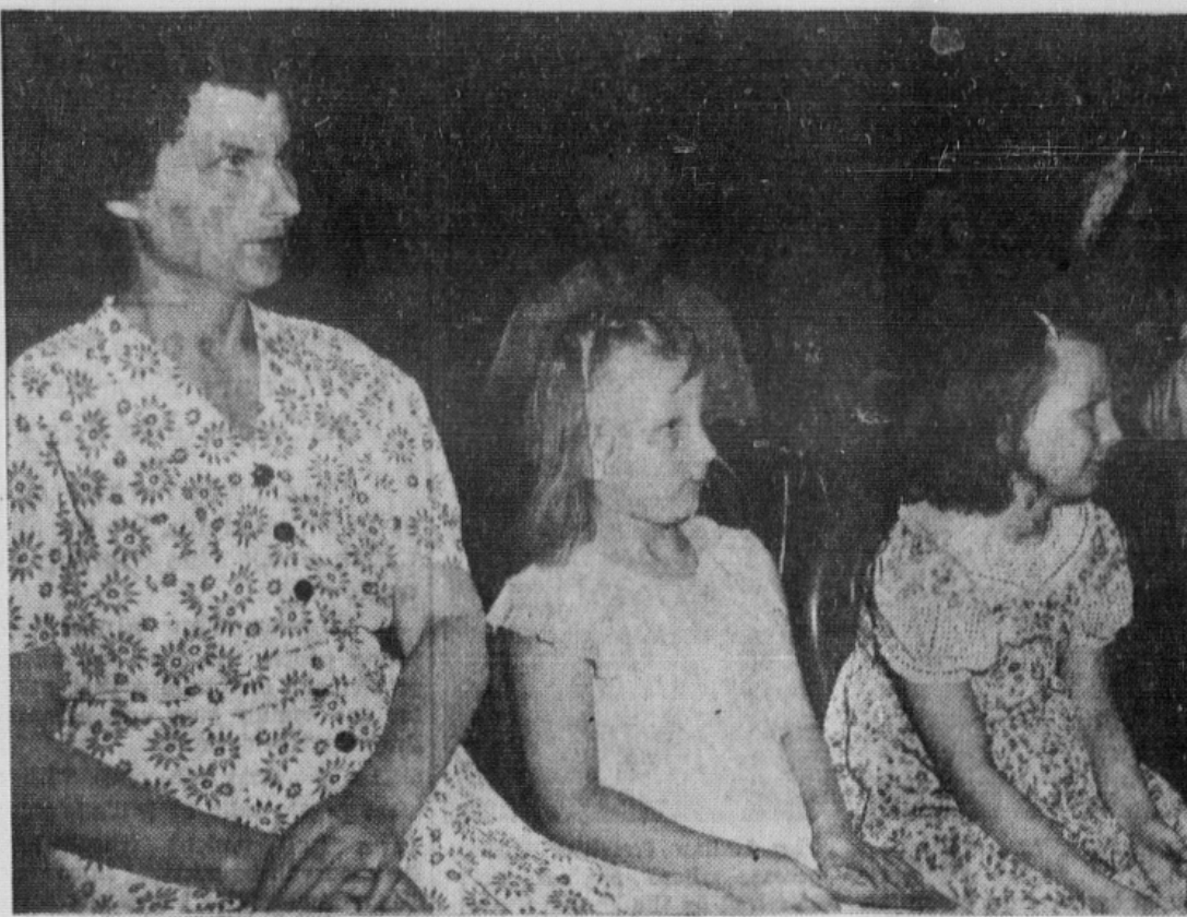
INTENSE INTEREST is shown by the Lithuanian-American mother and her two children above as they listen to speakers denounce the Nazi attack on the USSR and call on the government to send immediate support to help smash Hitlerism.

MOSCOW, July 2.—Red Fleet, organ of the Red Navy, announced completion today of a new Soviet warship. Its classification was not disclosed.