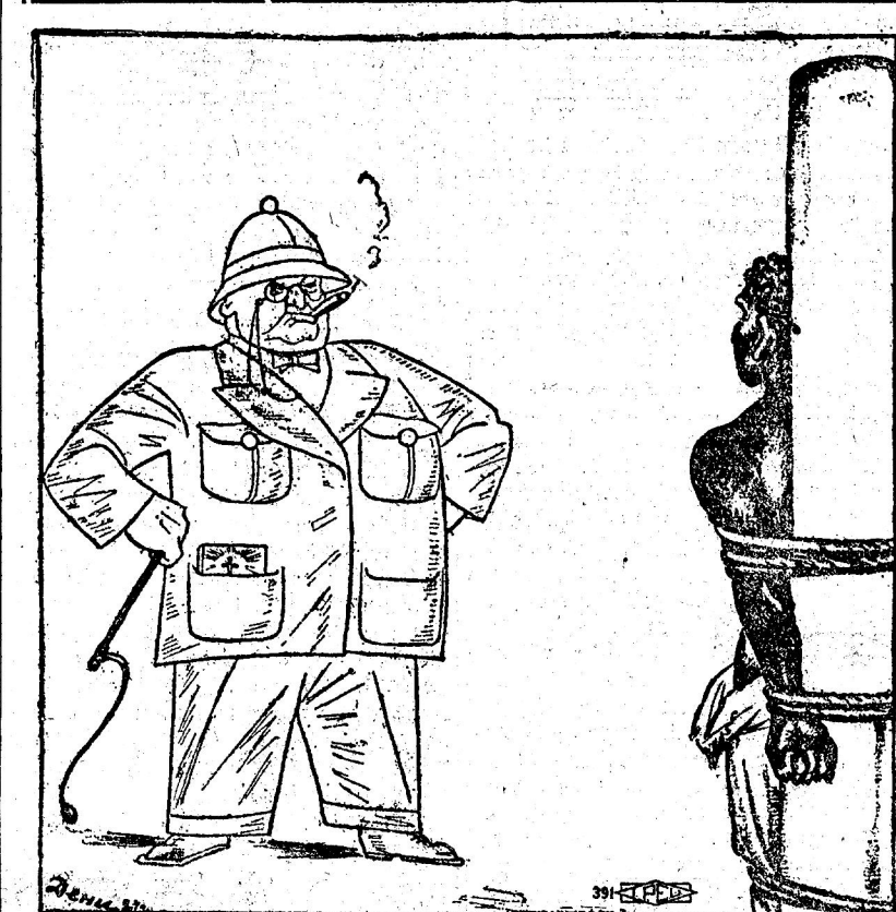
The Baldwin government and the colonies. (By Deni in the Moscow Pravda.)