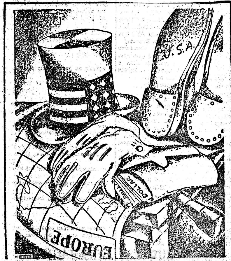
Ready to Hand Out Palmer-Daugherty Justice Under the Dawes Plan.