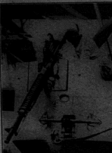
New Airplane Quick Firing Gun complete of Army 100 Shell's Minute

of 1917. Just prior war, every daily paper the activities committed acher Hunt. Our fight—As repelling us with tales—were told of the smiling station of women's brains, used by the awful German, discussed on all sides. Every hospital was reading war, aching war. At the Nurses' use "Table—wherever a group size congregated—the phrase, "If there's war will you can girls—bearing of the being done by the Allied nurse, one seemed as far away almost far. Everybody felt instinctively 24 hours closer. And it was