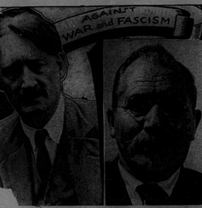
Distinguished French Writer, Author of "Under Fire" and Ten Old British Militant Labor Leader Who Have Been Spanning for the Anti-War Movement.

"Military Training Is Good For You" The sergeant who was in charge of the