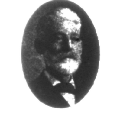
Author of 'Women's Work'

The question of whether men or women should control the schools is a complex one. It involves the issue of gender equality and the role of women in society.