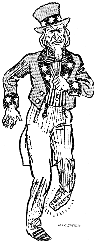
The New Leader (London, Eng.)

Concerned as the British workers are about their own unemployment problem, they look across the Atlantic and see that the shoe also pinches Uncle Sam.