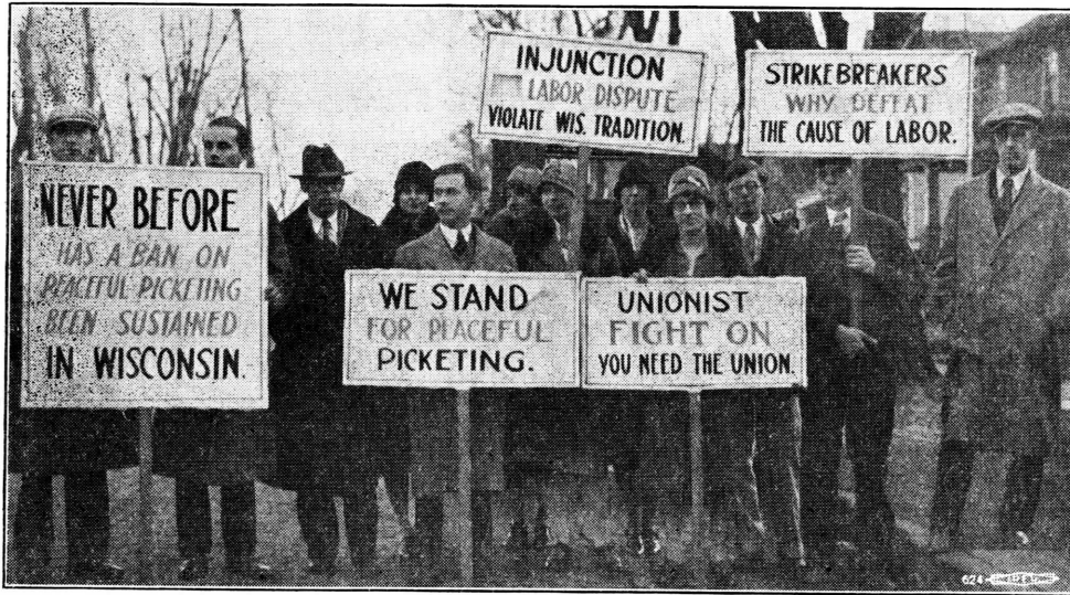
University of Wisconsin students picketing the Allen A, plant at Kenosha in protest against the injunction.

admissions of this strikebreaker and that strikebreaker that each carried blackjacks and guns and other dangerous weapons. They had not viewed the orderly demeanor of the 26 defendants—native Americans all, if that means anything—as they sat day after day in the court room. The jury had heard and seen these things—and their verdict was conclusive.