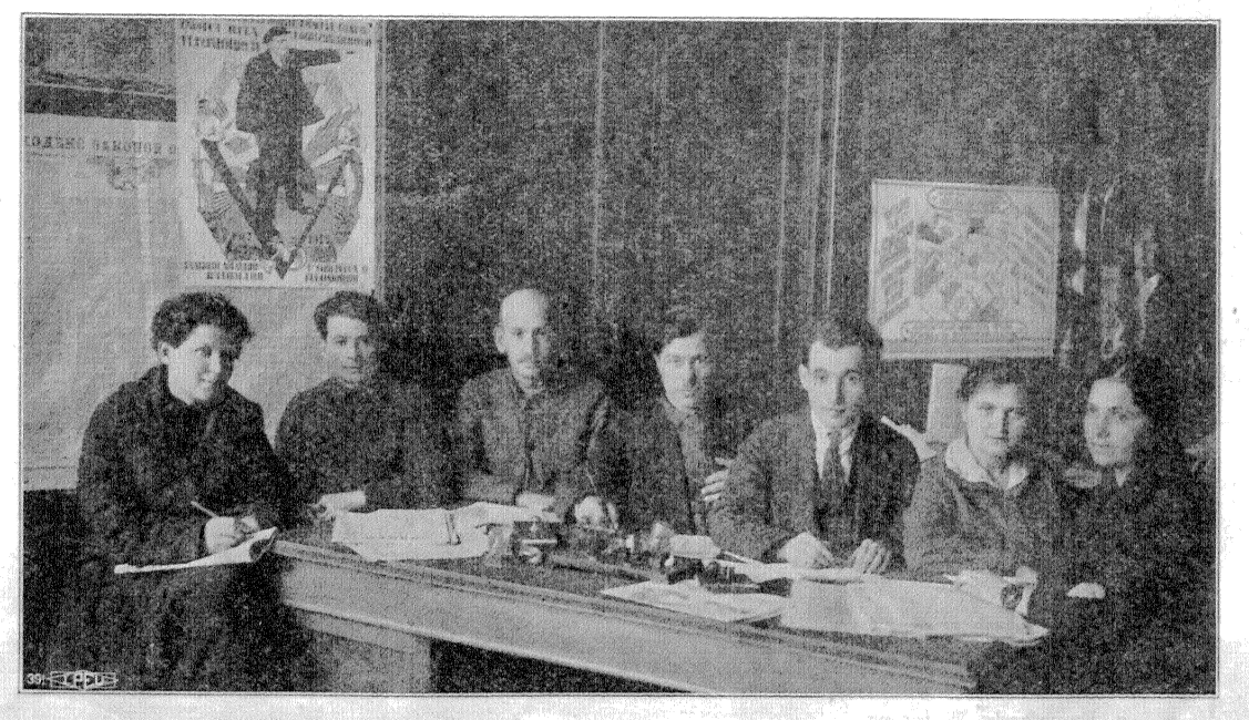
SHOP COMMITTEE EXECUTIVE OF THE MOSCOW EXPERIMENTAL FACTORY