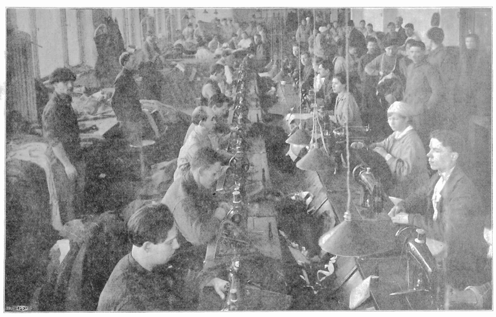
OPERATING DEPARTMENT OF MOSCOW EXPERIMENTAL FACTORY The center of the Garment Factory System of Soviet Russia operated in co-operation with the RAIC