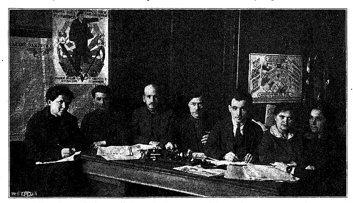
SHOP COMMITTEE EXECUTIVE OF THE MOSCOW EXPERIMENTAL FACTORY

Illustrating, moreover, the demand for better clothes on the part of special sections of the Russian people my informant went on: "Although nearly 90% of the 135,000,000 of present-day Russia are of the land-working class, large sections of this rural population are graduating into comparative civilization. For instance, many of the young peasants finishing their period of training with the Red Army are demanding civilian clothes, something like those they have seen worn in the cities. These young men constitute a sub-