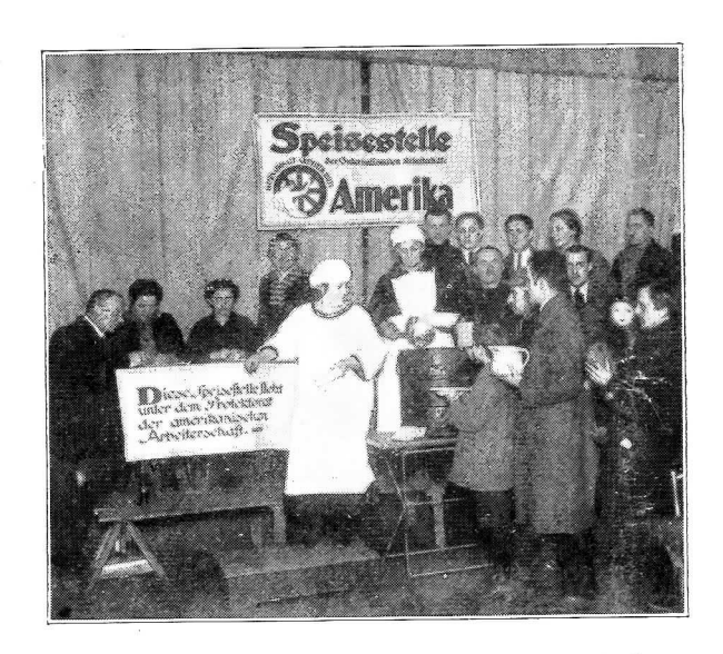
American Soup Kitchen-Petersburger Platz No. 3, Berlin