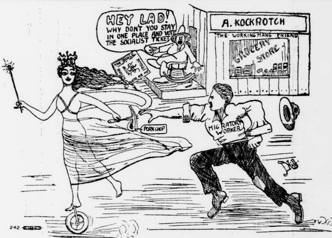
Saith The Soul-Sprite: "You're after me! You're after me! But I'm off for Tex-Layana for to help my Florryana! Bye Bye, my Western Bo!"