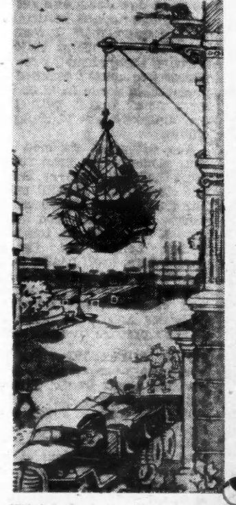
another load Watch out directives." - A "Kroke (Moscow) jibe at Soviet 1.11 reaucracy.

"Such a humiliation for a civilized human being," said the Major, emptying another glass of vodka