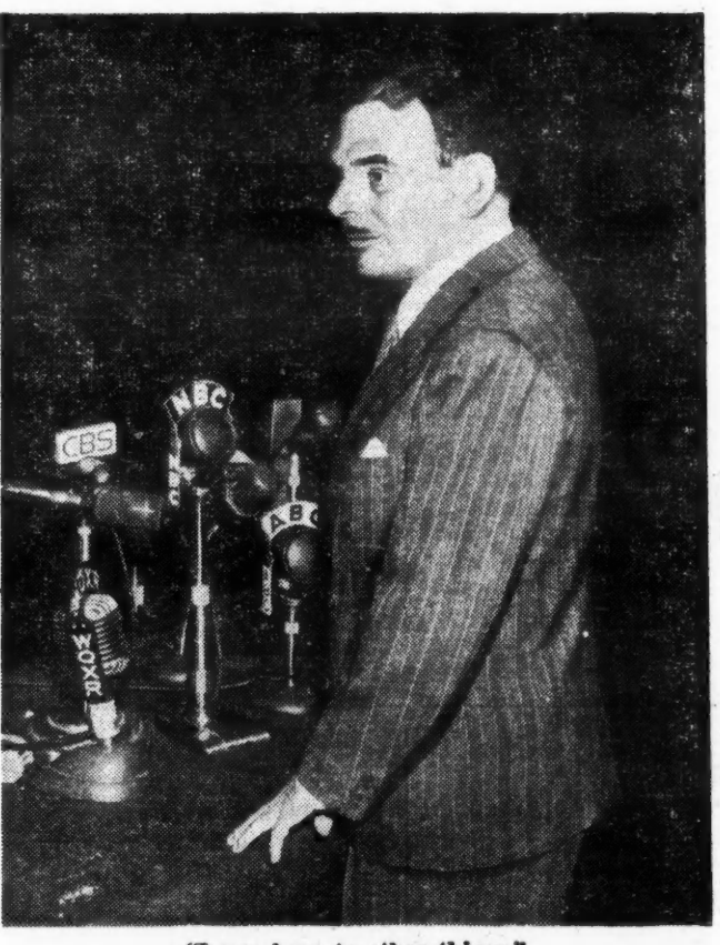
"I was born to other things."

Fifteen hundred little Democratic jobholders in Washing-ton started cancelling their sublet ads. Republican elevator operators and powder room matrons at the Senate started inserting sublet ads. Everybody in Washington sud-