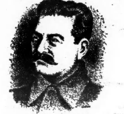
Stalin in the 1920's

In his interview in Pravda (Oct. 28), Stalin described the discussions in the Security Coun-cil as "a display of the aggressiveness of the policy of Anglo-Americans and French ruling circles." He said that Washington and London had repudiated not only the accord of Aug. 30 for a settlement of the Berlin crisis but also the monoficial Visbingty. Brannella don't agreement unofficial Vishinsky-Bramuglia draft agreement