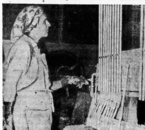
This girl works at a coating machine. She said she knew a girl who died from the effects of material being handled.

The insurance department of the Consoli-