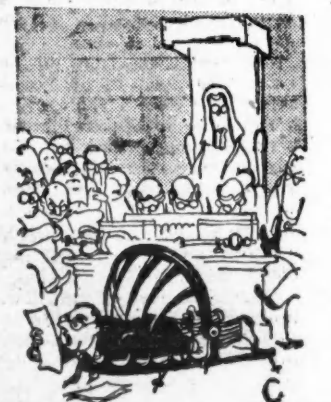
members will readily appreate the cruelty and inhumanity traps, if hunting is abolished!

ACROSS London's Leicester Sq. trooped huntsmen in tally-ho red tooting deer calls from their mounts In Parliament a shocked member rein Parliament a shocked member re-marked: "The unspeakable pursuing the uneatable."