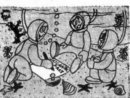
why they made that write under