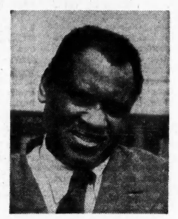
ROBESON in PRAGUE No window dressing

INTERNATIONAL SONG. An enthusiastic father could not restrain himself during "My