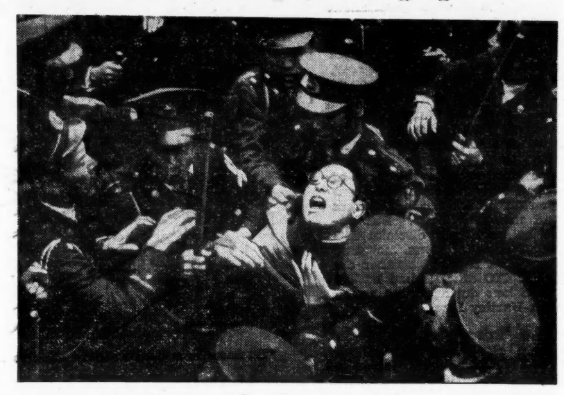
in Japan: Japanese Communists gathered for a rally back of the Tokyo Municipal Hall. They overstayed their permit-time-what happened to them.

DANCING GIRLS. In Switzerland the Neue Zuercher Zeitung "exposed" the "red" correspondents in a frontpage editorial, and went on to give the reason why no-one could report