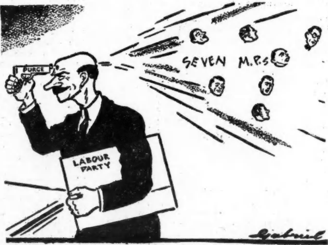
London Daily Worker

These moves are an expression of the deep-rooted anxiety at the way Labor leaders are going. The rank and file desperately fear a Tory vic-tory; yet they will only respond to a policy that promis-