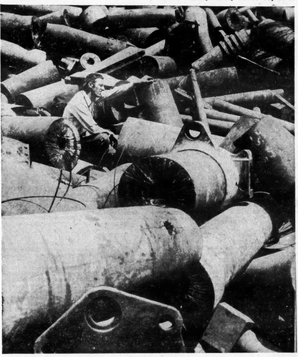
The Japanese had no further use for these cannon, made of U.S. scrap sent to Japan ten years ago, so they sent them back to us. The cannon will be resmelted at the Kaiser plant at Fontana, Calif. — perhaps to be made into new cannon and shipped again to Japan to help "contain communism" in the Far East.

4 U.S. working stiffs take a look at Europe