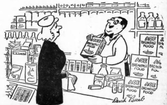
e except a low moan of delight as "Doesn't make any noise except

Health authorities say that any minute particles of aluminum which may be absorbed into the food are not poisonous. In fact, the Federal Trade Commission last year ordered one distributor of stainless steel utensils to refrain from telling customers aluminum is poisonous. As for retention of vitamins, all you need is any type of pan with a tight-fitting cover so foods may be cooked with a minimum of water.