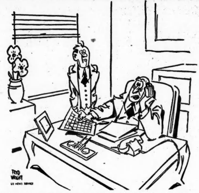
is so bad we may have to start laying off my

Headquarters are at 1050 Avenue of the Americas. Observers and individuals are invited to attend. Registration $1.