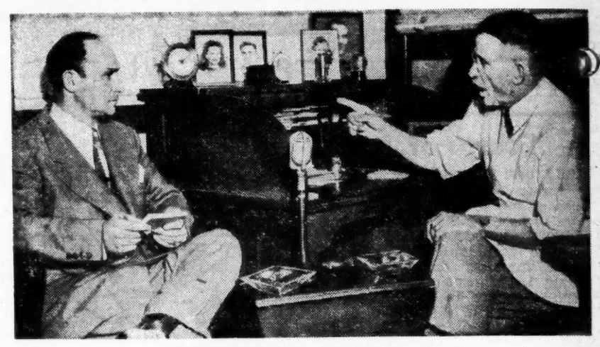
A club for gentlemen

Clayton Powell (D-N.Y.), giving priority to occupancy in publicly-built housing