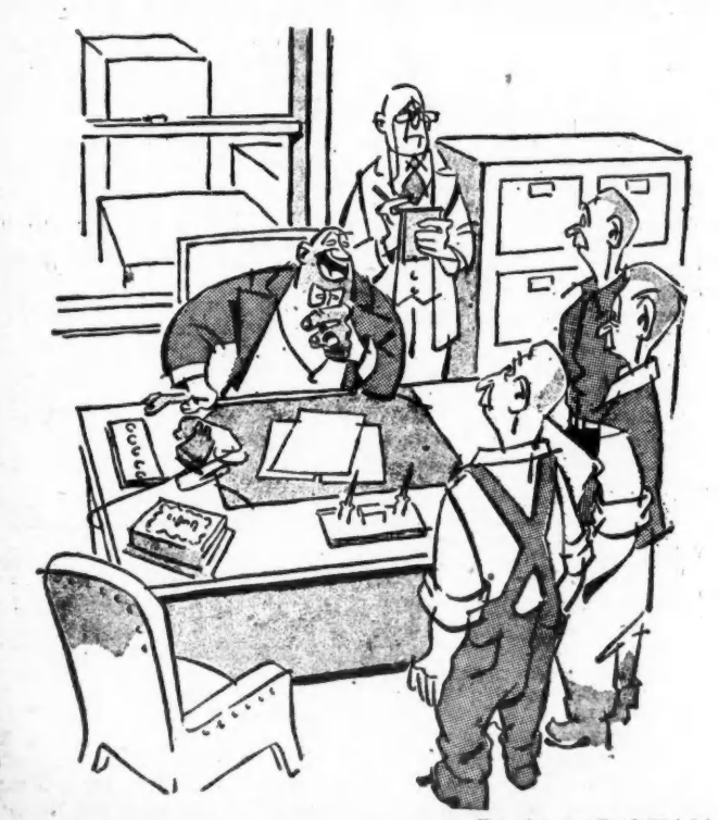
Well, boys, our Marshall Plan business has been so successful that we're laying off 20% of the force."