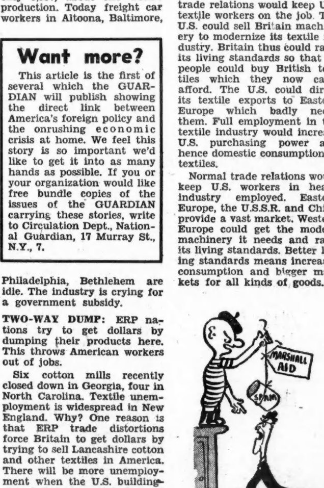
Staffy boy, beg properly."

Normal trade relations would Normal trade relations would keep U.S. workers in heavy industry employed. Eastern Europe, the U.S.S.R. and China provide a vast market. Western Europe could get the modern machinery it needs and raise its living standards. Better living standards means increased consumption and bigger markets for all kinds of goods. kets for all kinds of goods.