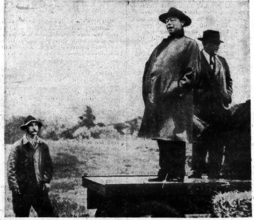
TAFT CAMPAIGNS IN OHIO The tall corn heard, then turned away

GOOD ADVICE: All of which jockeys the Ohio voter into a most unpleasant situation—unless AFL, CIO and all