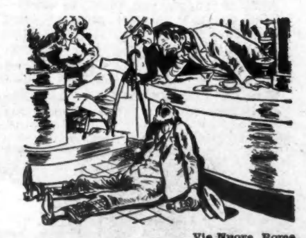
With Coke, there's really no need for the Americans to make any more A-bombs. . . ."

Despite advance stories that they were suffering from anemia as result of a constant rice diet, they said they seldom got rice, except when everyone else got it, along with fish, to celebrate a victory.