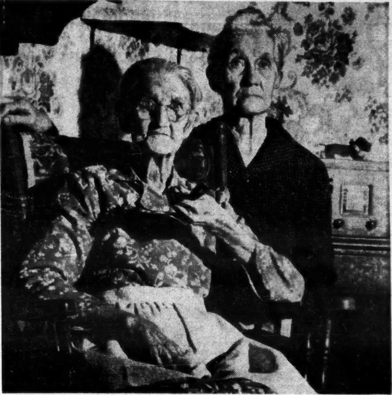
OUR SENIOR CITIZENS SPEAK UP See: Townsend Plan Convention and Northwest Report, page 8.