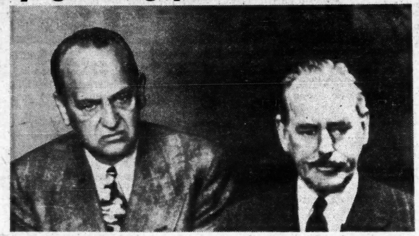
THAT'S JUST ABOUT HOW WE FEEL TOO, SENATOR

ON Decoration Day the President of the United States paid respectful homage to America's war dead including the 314,094 who perished fighting fascism as allies of Russia. Then he called for another $1,222,500,000 to supply more arms and more bombs to anti-Russian governments all over the world. While he prepared his address, paraplegic veterans waited to ask him not to tear down their hospital at Van Nuys, Calif. After ten days of waiting in vain, they began picketing the White House