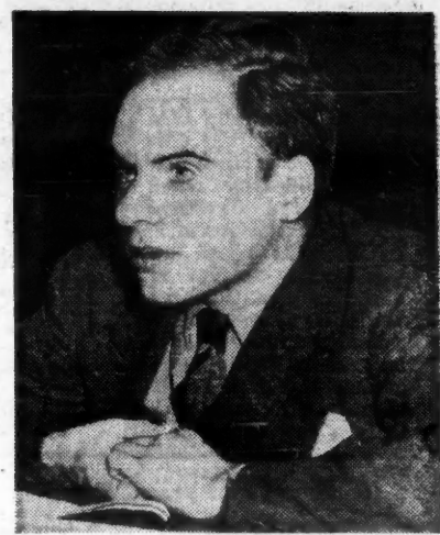
PHILIP MORRISON Atom could spell TVA

ovation when he proposed that "some-thing new" must be added to American toreign policy. Morrison's suggestion was a "giant atomic power plant in the great Southwest region—a new kind of TVA—for one-third of America's yearly appropriations on the H-bomb." Morrison said that "control over the future of the world may well go to that nation offering peaceful mastery of atomic energy—not the nation devel-oping it for a better bomb."