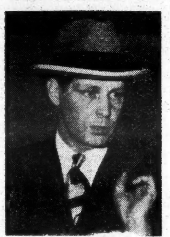
MAURICE TOBIN Impartiality-what's that?

GENERAL ELECTRIC: UE represents 36,693 workers in 35 plants, plus 7,500 in Canada. IUE represents 38,000 workers in 22 plants, Representation is in doubt for 15,908 workers in GE's Lynn, Mass., plants. IUE won Lynn by a narrow margin, but UE has protested the