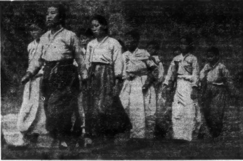
WOMEN ARRESTED IN SOUTH KOREA AS GUERRILLAS Just before the war broke, these women were arrested as "trouble-makers" by the South Korean forces and put in a stockade. What their fate was nobody knows. But judging by previous treatment of dissidents, it is certain it was not light.

During the fighting south of Scoul, American advisers . . . on three different occasions saw units move forward to defense positions, only to return two hours inted with the explanation: "We were ordered to withdraw." It was impossible to learn where the orders came from.