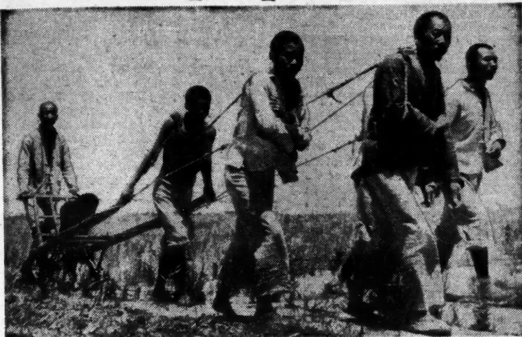
THE PEOPLE OF ASIA WANT A NEW LIFE In Formosa (left) the women squat beisde an irrigation ditch to do the Sunday laundry. In Siam (above) the peasants don't have the means to buy animals,

been no industrial development. The been no industrial development. The Hukbalahap revolutionary army, whose leadership includes Communists, is now spreading its influence wider from its former tiny base in Central Luzon. It has attacked Montalban and San Mateo, only 15 miles from Manila, and its influence has spread to the islands of Mindanao and Ilolo.