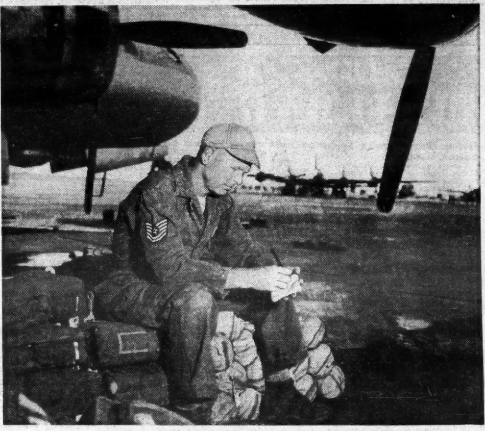
"Dear Ma, by the time you get this . . . "

GI sits on parachute packs under the wings of a B-29 as he writes his last letter home before uitting "stateside" for the war in Korea. In the editorial on this page (left) one of his buddles sums up the feeling of the boys fighting there. Will this one return to tell how he felt?