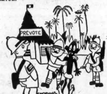
"Here's another native insists on joining our expeditionary force. . . ."

In other words, the U.S. began to form and carry out its own plans for so reorganizing industry as to save capitalism wherever it deserved to be saved.