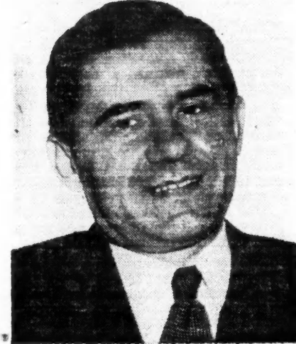
ANDREI GROMYKO First one sets the aim

"One sets itself the aim of strengthening peace among peoples and developing political and economic relations among them despite the difference in existing social systems. This policy is directed toward developing large-scale peaceful civilian construction and en-