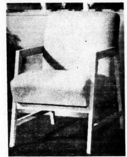
No. 3753. Occasional Chair with hair and latex filling. Arms and legs birch or maple with wheat finish. Size of seat 18"x20", width 23" height 34". Regularly 579 up. Covered in heavy muslin B, $61.75. In muslin A, for covering with 234 yards