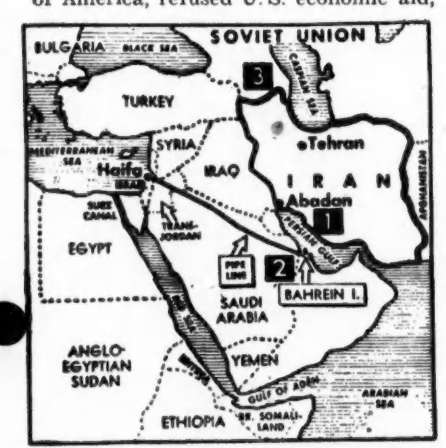
— highly inflammable (1) Abadan, Anglo-Iranian Co. oil center, where troops recently dispersed thousands of Iranian demonstrators; (2) In addition to alerting a parachute regiment at home, the British government has warships lying in the Persian Gulf; (3) The U.S.S.R. is entitled by treaty to send troops across its border if other foreign troops enter Iran.

Played up as a model Point 4 prorayed up as a model roll 4 plogram, though in fact designed to make Iran a war base, OCI's plan became "a popular joke" (AP, May 23, 1950). Business Week (July 1, 1950) reported Iran "on the brink of serious economic collapse," and the program halted by "political snags." In October the State Dept. tried to bolster the plan with a $25,000,000 Export-Import loan. But the new Premier Razmara, who had been new Premier Razmara, who had been seen as a pro-Western strong man, canceled OCI's contract, ordered U.S. advisers out of Iran, banned the Voice of America, refused U.S. economic aid,