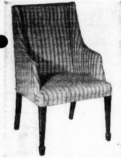
No. 3729. Upholstered Chair, especially handsome in pairs as fireside chairs. Moss filling with mahagany legs. Size of seat 19"x19", width 24", height 41". Regularly $70 up. Covered in heavy muslin B, $58.50. In muslin A, for covering with 3½ yards of your own fabric: