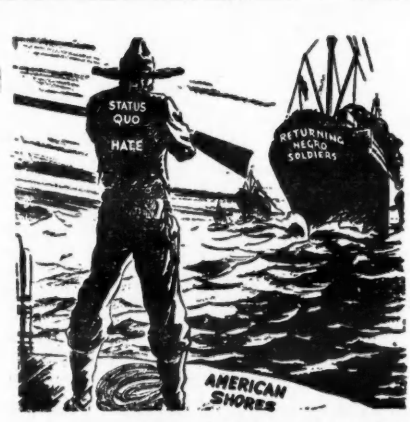
Arkansas State Press, Little Rock Must they come home to this?

"RE-EDUCATION" FOR NAZIS: The price of jimcrow was being paid in Germany, too. Karlsruhe was a "lily-white" soldiers' town until two Negro units were stationed there. White soldiers warned the Negroes to keep out of the night clubs; the Negroes defied them. Result: more than 100 soldiers battled each other with bottles for half