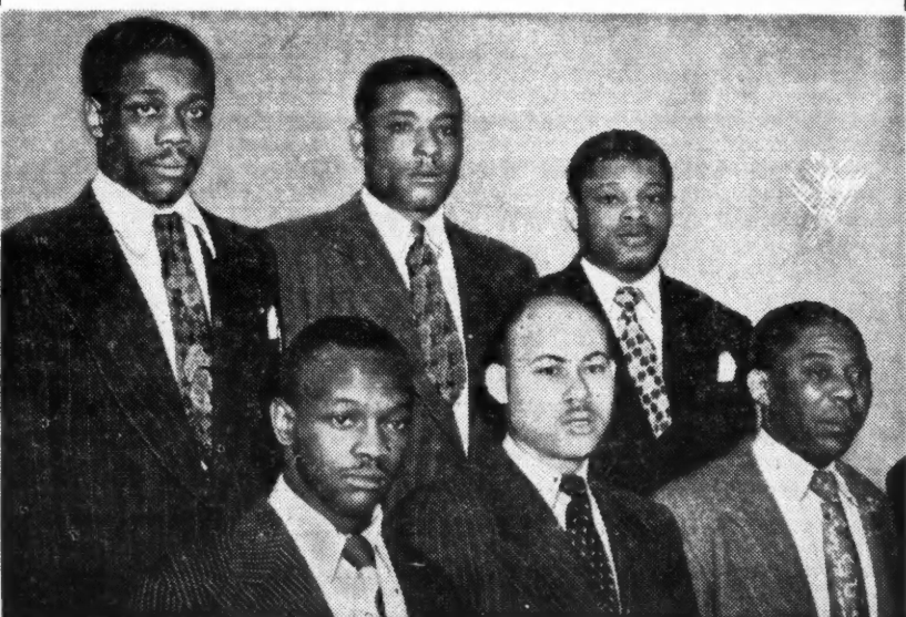
THE SIX DEFENDANTS AT TRENTON