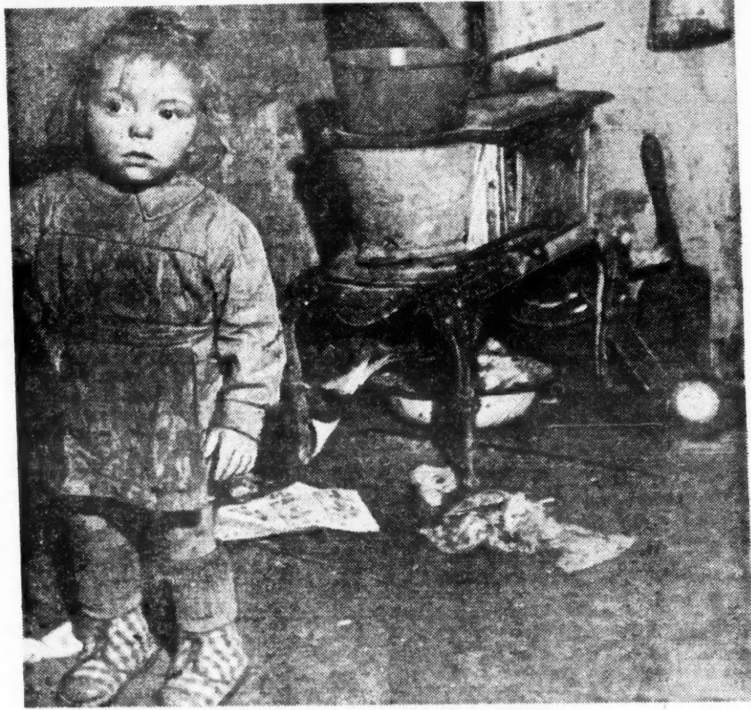
INFLATION DOESN'T LEAVE MUCH A little French girl looks into the future

their living standards? Both groups, say the UN economists, need a huge invest-ment program (in Italy, fulfilment of such a program would require "some interference with existing private interests"). But both groups, says common sense, need above all to decide for themselves how to rebuild without Washington dictation, which keeps the southern group from achieving pre-war industrial output levels and both from