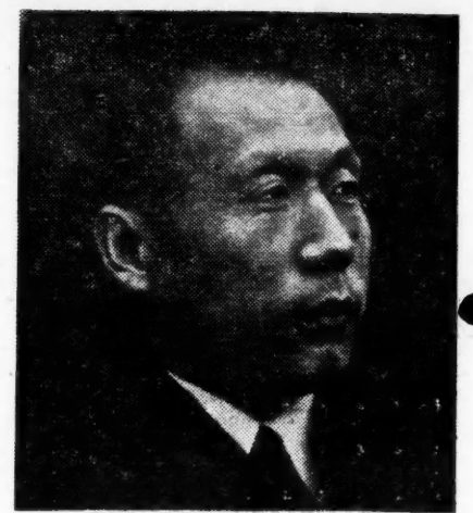
GEN. WU HSIU-CHUAN Instructions from 475 million

Assembly the U.S. pushed through the Acheson plan giving to the Assembly the security duties and powers reserved for the Security Council (particularly to vote sanctions against an aggressor). One paragraph called for earmarking of troops by UN members for UN duty. The replies from member states have