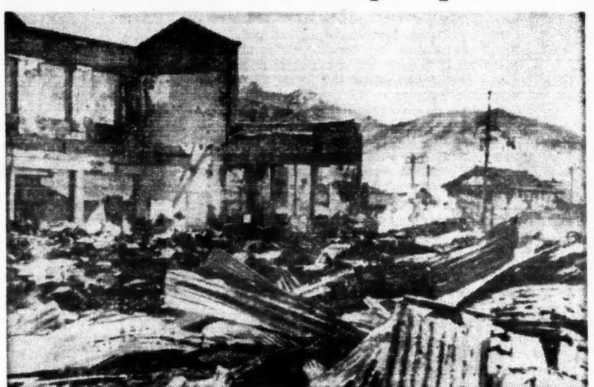
EVER SEE A CITY DIE?