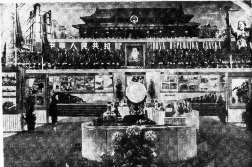
CHINESE EXHIBIT AT THE PRAGUE TRADE FAIR Silks and ivories of old Cathay . . . and tires and ball bear and tires and ball bearings

A year ago, I saw a similar exhibition at Poland's Poznan Fair. The progress in 12 months is striking. It is now possible to see how in each of the new democracies the economy is moving towards a balance between industry and agriculture. The lie that the Soviet Union is exploiting the resources of these countries for her own benefit is completely exposed. It is clear to all that with Soviet techniques placed at their disposal Czecho-slovakia and Poland, with Soviet as-sistance, are rapidly increasing their