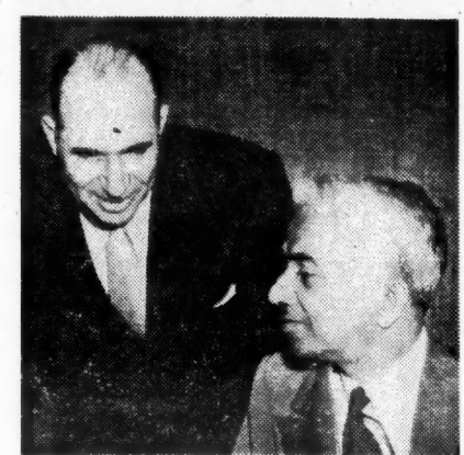
FAWZI BEY & BENEGAL RAU Times change, some people don't

new phase of the serious divergences new phase of the serious divergences between the Western and Eastern bloc, divergences which threatened world peace and security." He said the UN had done nothing in other cases of aggression and violation of sovereignty of territories which had been brought before it. (This was a reference to Egypt's complaint against the British for keeping troops at the Suez Capal for keeping troops at the Suez Canal, and the resolution on internationaliza-tion of Jerusalem—voted by a majority at UN but never implemented).