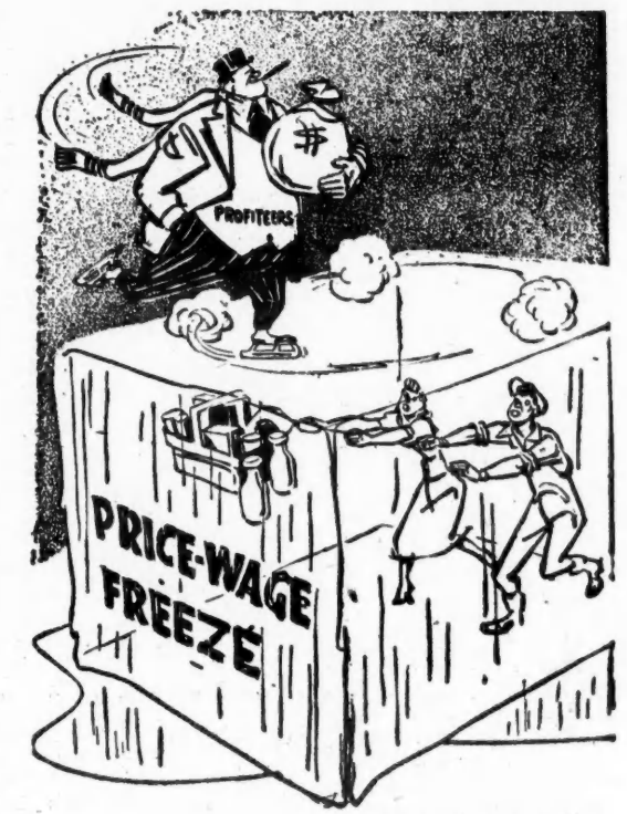
Drawing by Fred Wright

· Average spendable income fell by $105 or more