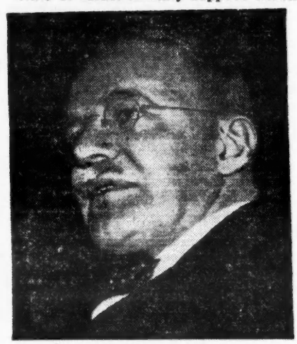
ALLEN W. DULLES

The Czech government gave the new state of Israel military supplies which