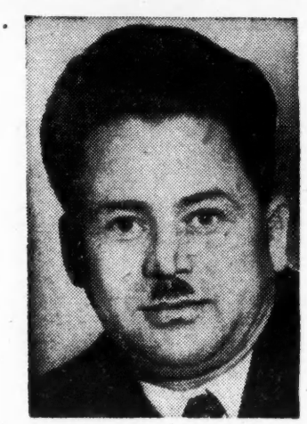
FARHAT HACHED They would not be silent

Consider: more than one half of the people on earth are women, and all en want peace.