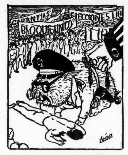
Noticias de Venezuela, Mexico City THE MILITARY DICTATORSHIP

THE MISSING 24 HOURS: The elecseemed so secure that the govern-t was prepared to count ballots honestly. But by 10 p.m. Dec. 1, early returns showed URD well in the lead with 50% of tabulated ballots. After that censorship was clamped down. On Dec. 2, the army declared that one