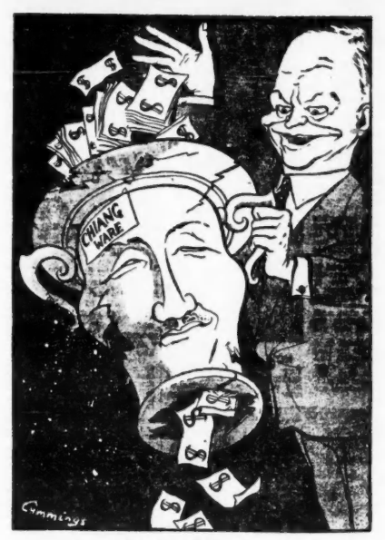
Cummings in Daily Express. —let's put our faith in this elegant old Chinese vase once more."

SILVERMAN [Labour]: "... It is not quite true, is it, to say that the alternative proposal was an insistence