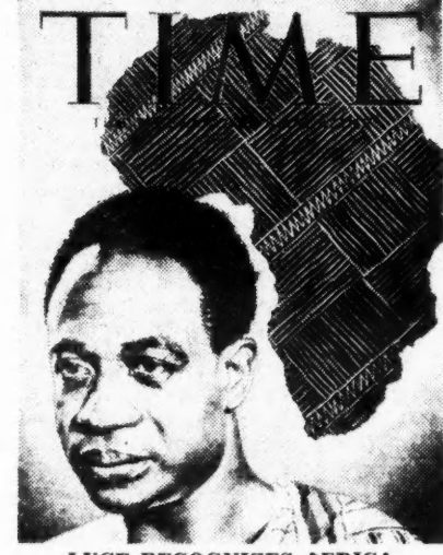
CE RECOGNIZES AFRICA Time smiles on Nkrumah

Two new elements have appeared in colonial Africa since World War II: the experiment described as "creative ab-dication" in the British colony of the