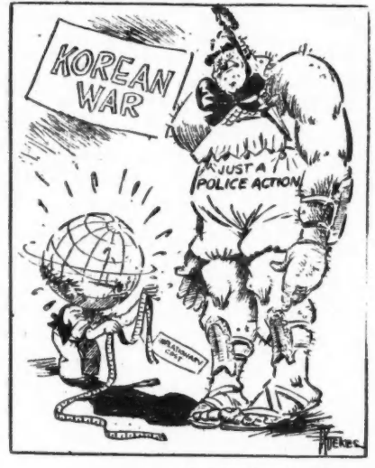
Cleveland Plain Dealer "He keeps on growing."

only be attained in peace. Malenkov's emphasis as the new government was presented for Supreme Soviet ratification, and the sim lar one made by Deputy Premier Beria and Foreign Minister Molotov, "created a sensation" (wrote N.Y. Times corressensation" (wrote N.Y. Times correspondent Harrison Salisbury from Mos-