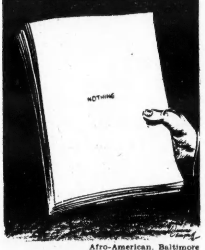
IKE'S RECORD TO DATE

TELEVISION: A "March of Time" TV program showing lily-white Levittown, Pa., as the U.S.'s "most perfectly