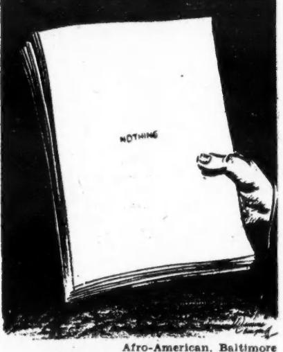
IKE'S RECORD TO DATE

TELEVISION: A "March of Time" TV program showing lily-white Levittown, Pa., as the U.S.'s "most perfectly