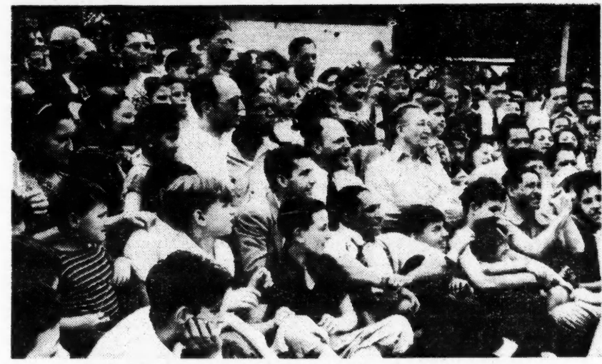
THE FACE OF THE INTERNATIONAL WORKERS ORDER Members watch a baseball game at a summer picnic