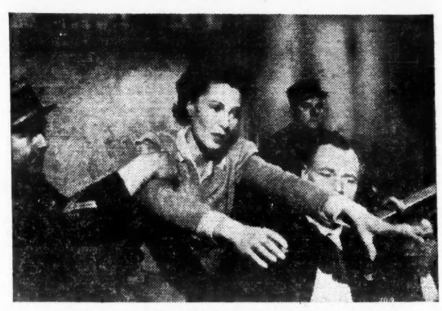
IN THE COURTROOM IN "JUSTICE IS DONE"

You can get hundreds of listings of children's activities — many free, many listed nowhere else — for every day of the month, in advance! For one year subscription (12 Monthly Issues) just send $2 with name and address to Box MC. Guardian, 17 Murray St., New York City 7.