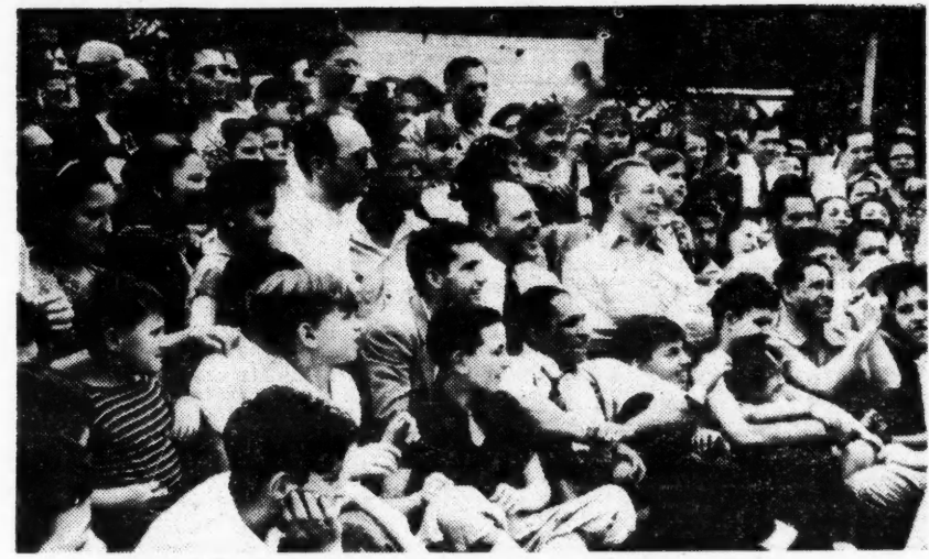
THE FACE OF THE INTERNATIONAL WORKERS ORDER Members watch a baseball game at a summer picnic