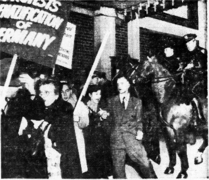
WHEN THE COPS RALLIED TO HOLD NEW YORK

SCHOOLED IN POGROMS: Before the outbreak-one of the most savagely anti-Semitic since Peekskill—the east side had been flooded by the new "displaced persons" from the Ukraine and Poland, many of them veterans of the fascist