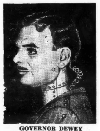
His mechanism was showing

RENT: At GUARDIAN press time both houses of the Legis-