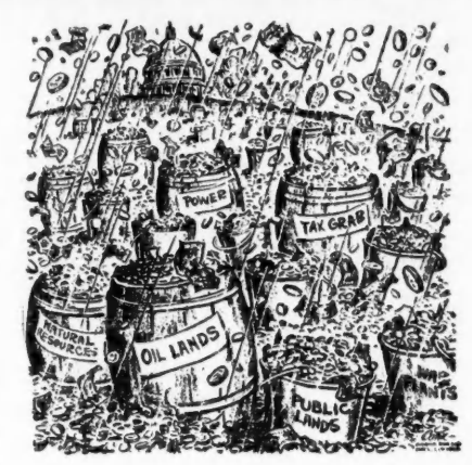
"April showers bring — ?"

LEWIS SQUARES OFF: A big fight was brewing over McKay's appointment