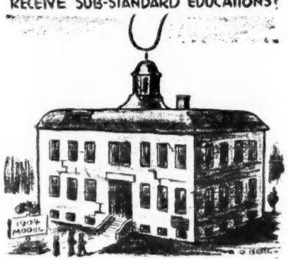
Let those who block public school funds answer! Church and State, Wash., D.C.

then went home. He could not, he told the President, "defend a budget which I consider indefensible." Cuts already made, he added, "are making it impossible for anybody to serve education through this office."