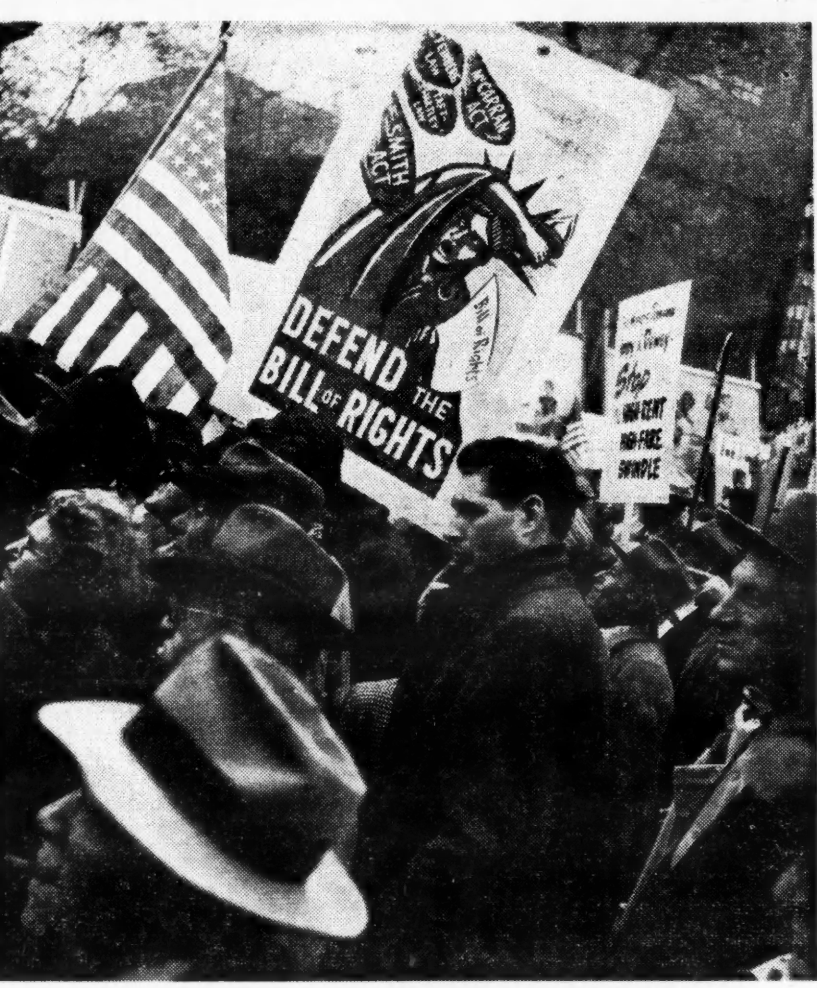
THE SLOGAN WAS: COURAGE IS CONTAGIOUS New York last week saw three big rallies: May Day in Union Square (p. 5), the Rosenberg demonstration on Randall's Island (p. 6), and the Guardian Free Press rally at Palm Garden (p. 2). The photo above, taken in Union Square, symbolized the spirit of all three meetings.