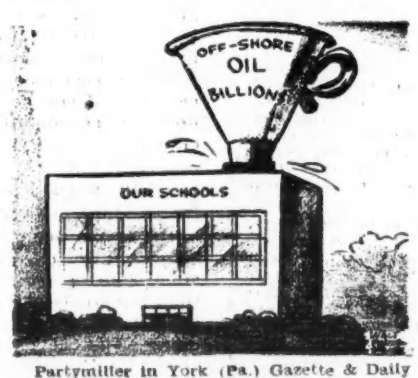
"What a help that would be!"

WINNER TAKE ALL: In all agencies of the government's executive branch the Republicans were playing by the rule, "Winner take all." Competent career men with up to 40 years in gov-