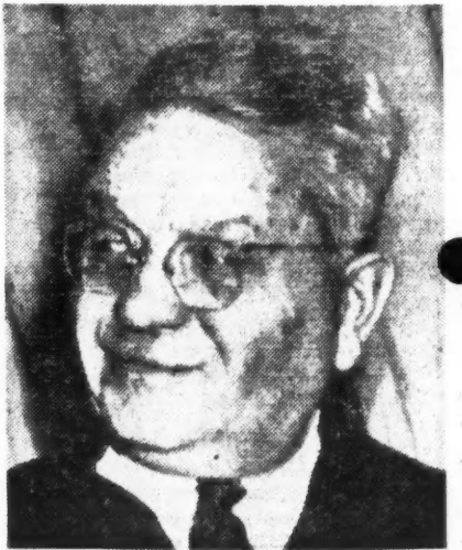
HAROLD C. UREY There was integrity . . .