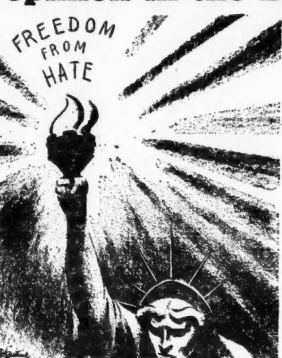
Fitzpatrick in St. Louis Post-Dispatch "Look up, Brothers!"

Jury in the U.S. District Court for this district for two days. ... Significantly, the government does not claim that, with one exception, any fact now relied upon as grounding his detention without bail