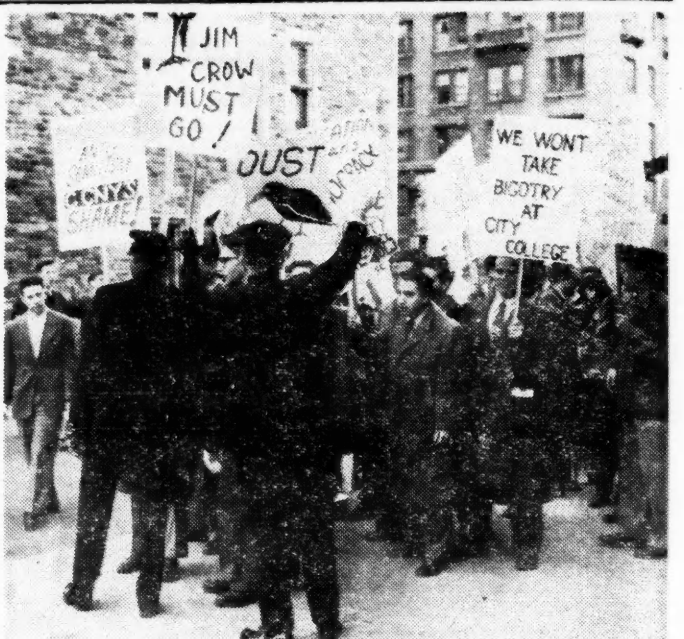
THE CITY COLLEGE DEMONSTRATION IN '49 There were echoes four years later

LIBEL CLAIMED: The press played up the strike, ran pictures of police charging pickets, but played down the issues at stake and denounced the strike as "communist." The N.Y. Times was promptly sued for libel by Student Council lead-