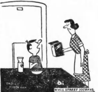
Wall Street Journal "This is awfully quiet cereal!"

My deep appreciation of the heavy sacrifices that you make for the continuance of the paper. W. P. C.