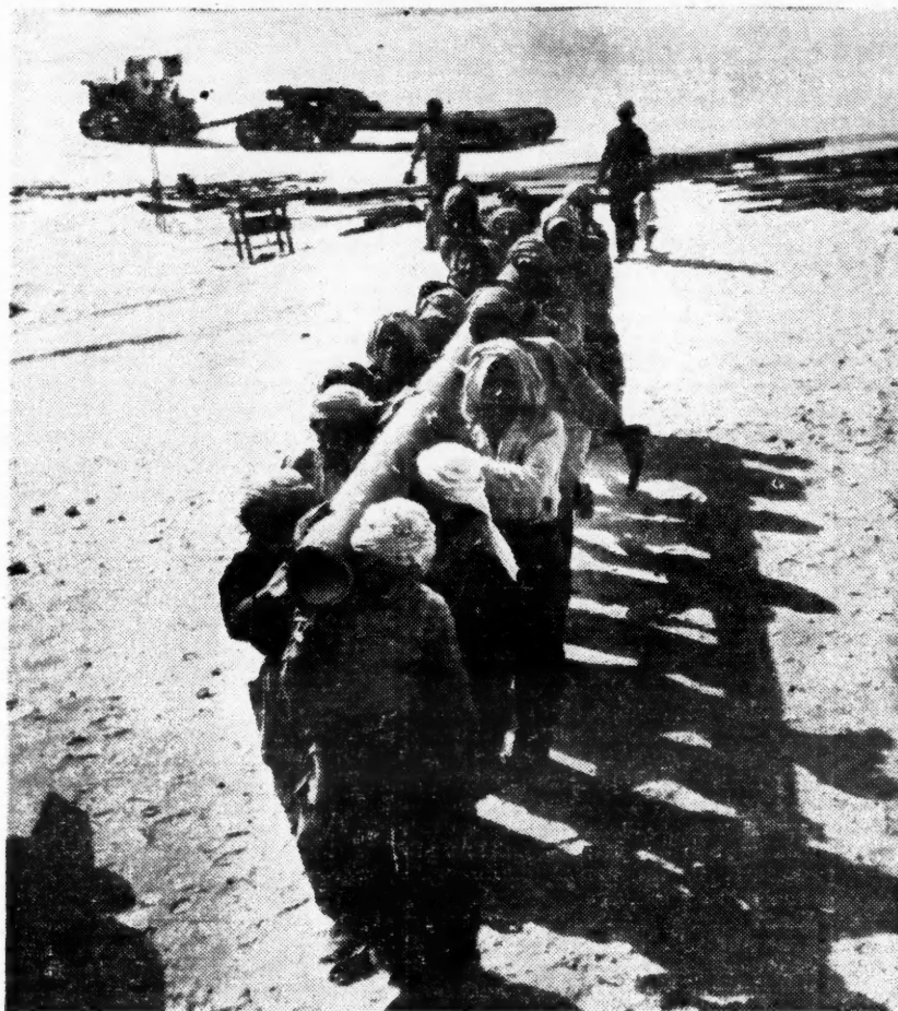
THE WEALTH OF ARABY IS PIPED TO STANDARD OIL, N.J. A work gang carries a pipe toward a drilling rig in Saudi Arabia

the movement of troops to British Guiana, the overthrow of the PPP Government and suspension of the Constitution . . . [were] planned . . . [and] put in train at the time of the sugar strike and clearly related to that emergency, such as it was, and nothing else (NS & N, 10/17).