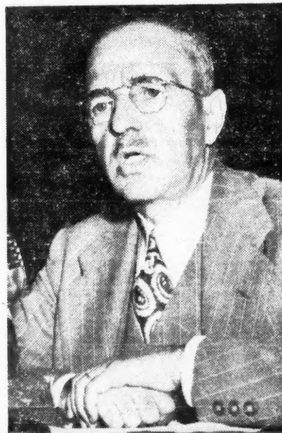
HARRY DEXTER WHITE In life he spoke out boldly