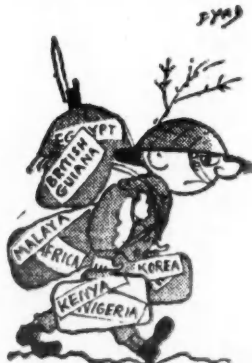
Drawing by Dyad, London The unpopular front