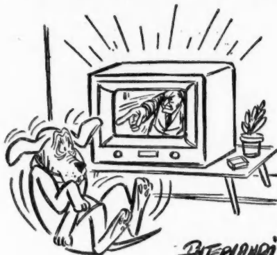
Daily News, Los Angeles

REAFFIRMATION : As of Nov. 9, the October NWR had already been held up in the post office for over two weeks.