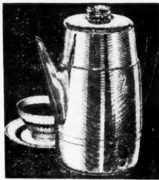
CAMFIELD AUTOMATIC COFFEE MAKER

No more worving about getting your coffee "right." Simply set Camfield's EXCLUSIVE FLAVOR SELECTOR to the strength you like, plug it in and forget about it. It will signal when done and remain at serving temperature for you to have a second cup when you desire. Chrome plated on a copper body makes cleaning simple. Serves up to 10 cups. LIST PRICE $29.93