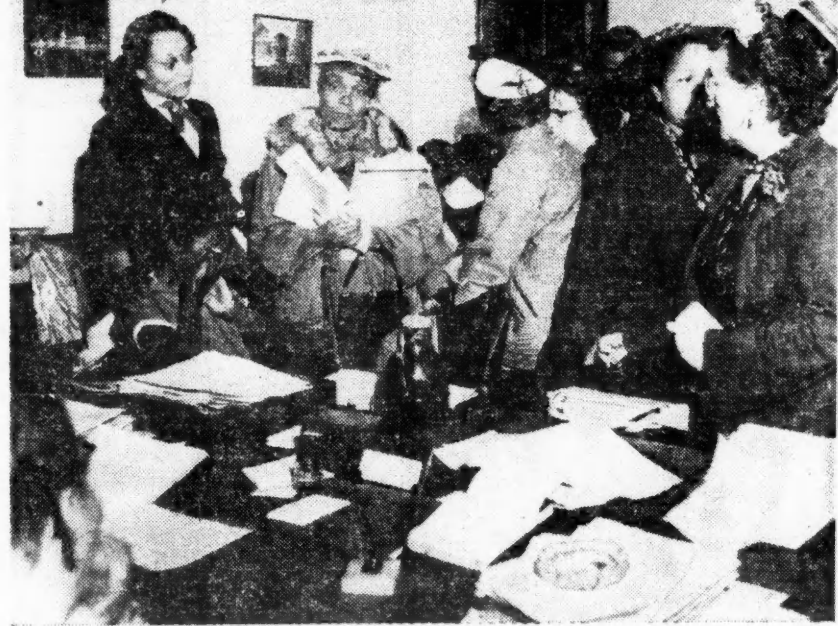
THEY LISTENED, THEY WERE SILENT, THEY REFUSED

"Me and my children, we were getting along all right until he started at me. He couldn't make me go his way and he got mad. The last time he tried to make me go his way I