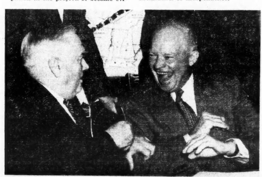
YIPPEE! GET THE GRAB BAGS OUT AGAIN Sen. Wiley and the President at Seaway signing ceremony

Eisenhower's ceremony on May 13 might have been historic after all: it could be the beginning of Canada's declaration of independence.