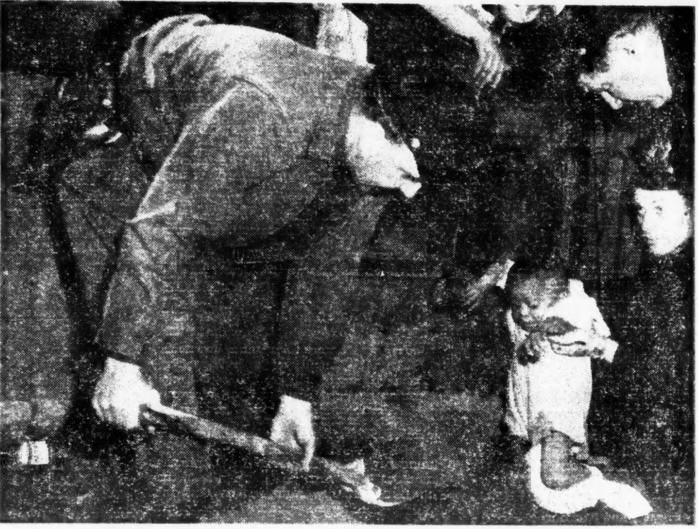
BARNEY'S BOOBYTRAP-OR. THE PERILS OF LIFE IN THE BIG TOWN

MOVING . STORAGE FRANK GIARAMITA & SONS TRUCKING CORP. 13 E. 7th St. GR 7-2457 EFFICIENT . RELIABLE