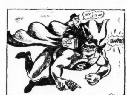
Bidstrup in Land og Folk, Copenhagen

2. To build a pact "with teeth in it," with the support of Asian and Western