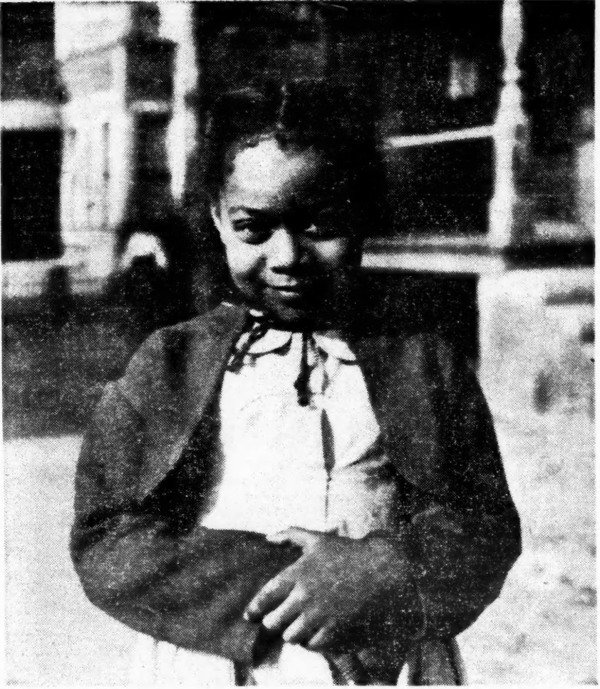
For her the future looks brighter See story on school segregation decision below