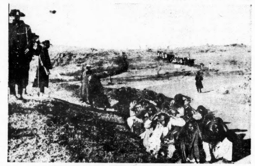
WE ARE LITTLE BETTER OFF THAN DEAD. by British colonial police in Kenya

"We are little better off than dead "We are little better off than dead ... European young men in the Police Reserve [are] arresting people ... and taking them at night to the forest ... where they handcuff them together, shoot them, and leave their bodies there as 'proof' that they were 'terrorists.' ... Any man [with] property is called 'Mau Mau treasurer.' Any educated man is said to be a 'Mau Mau secretary.' . . We demand a commission of inquiry . . . from Britain; [but] if all the responsible Africans have been killed . . . who