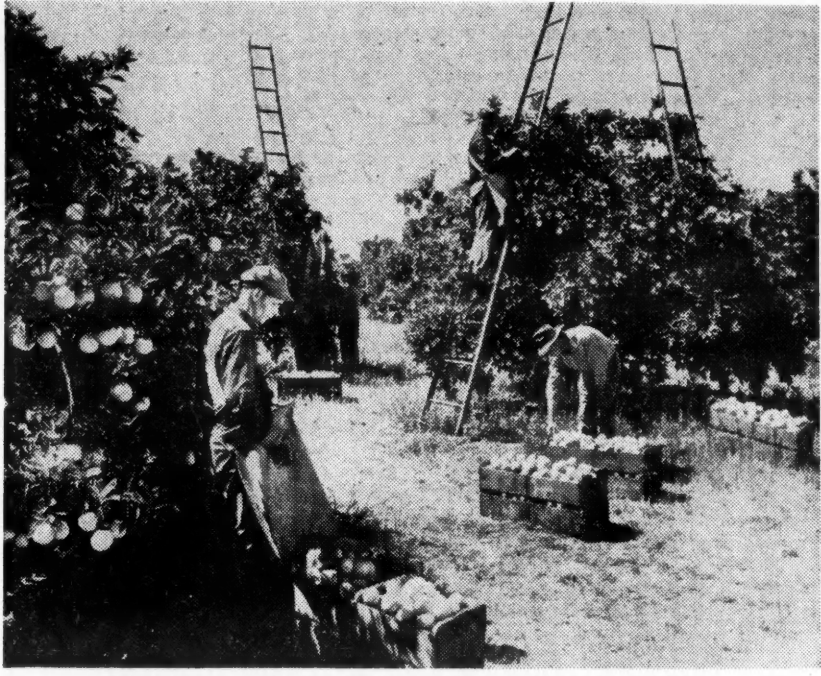
PICKERS AT WORK IN AN ORANGE GROVE IN FLORIDA The bags are heavy, the danger of accident great

PICKERS ARE THE KEY: Of 4 million workers (2 million migrant) in U.S. agricultural industries, 100,000 work in citrus, the country's greatest fruit business. The union sees the 16,000 citrus pickers as the key to organiza-tion, because if they don't pick, plants