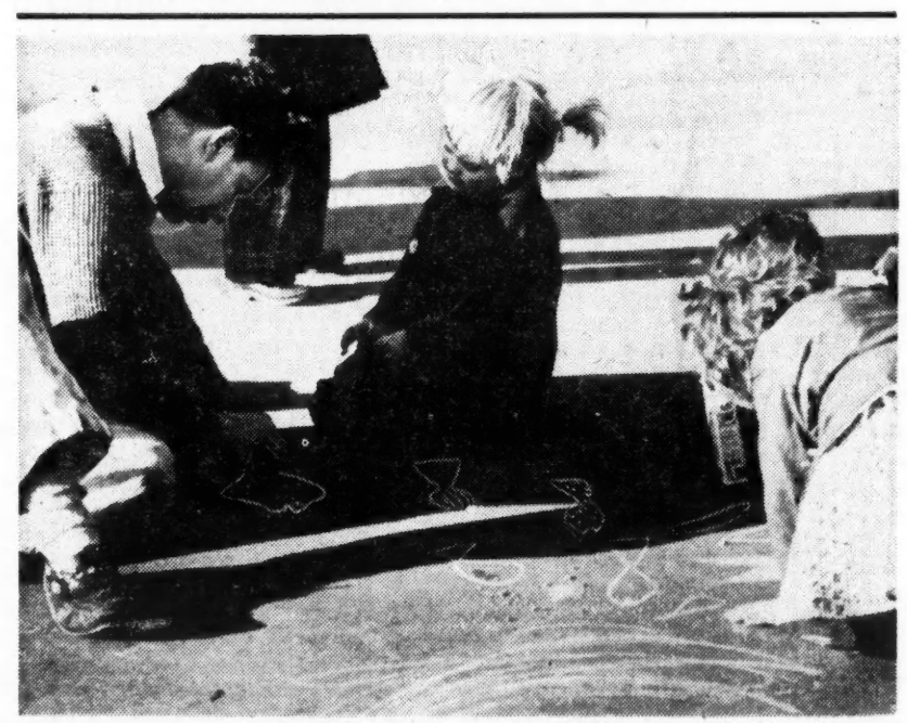
SPRING COMES TO MANHATTAN A street scene at the Fifth Av. entrance to Washington Sq. Park

The Afro-Asian conference: who's who and what's what The conference was called by the Prime Ministers of Burma, Ceylon, India, Pakistan and Indonesia, meeting at Bogor, Indonesia, Dec. 28-29, 1954. Besides these five, the 25 countries invited were: Afghanistan, Cambodia, Central African Fedn., China, Egypt, Ethiopia, Gold Coast, Iran, Iraq, Japan, Jordan, Laos, Lebanon, Liberia, Libya, Nepal, the Philippines, Saudi Arabia, Sudan, Syria, Thalland, Turkey, N. and S. Vietnam, Yemen. (The European-dominated Central African Fedn. government—See DuBois p. 5—refused to attend.) The purpose of the conference was declared to be: to promote good-will and co-operation among the nations of Asia and Africa; to explore and advance their mutual as well as common interests; to consider social, economic and cultural problems, and problems of special interest to them (for example, national sovereignty, racialism, colonialism); to view their position in the world today and their potential contribution to promoting world peace and co-operation. The first issue of the Afro-Asian Conference Bulletin, published in Bandoeng, said: ". . There has been a slogan which ran 'Let Asians fight Asians.' That is precisely what we do not want. What we want is to co-operate with our Asian and African neighbors to live together in friendship and in peaceful co-existence, to strive hard, united in aim, for the common benefit of all."