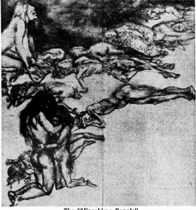
The "Hiroshima Panels"

AFTERMATH: But for the unready or the untrained, the mass of people, death is likely. Radiation sickness is roughly of three kinds: an acute and irresistible three-dimensional sunburn, killing in a day or so, for those nearest