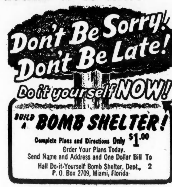
AD IN BALTIMORE SUN, MARCH 6, 1955 Sew yourself a straitjacket next

fully avoiding blunt references to death in his Sunday-supple-ment story, Peterson predicts "the sternest possible crises Americans will probably ever face" but adds that "as a result of even greater developments... America will emerge as a victorious, continuing nation."