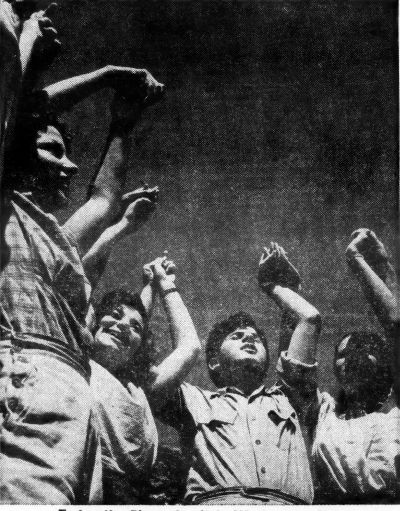
Today the Pharaohs sit in Western capitals The children of Israel dance in their holiday season as tension mounts at the borders. For reasons behind the trouble, see dispatch from Tel Aviv, p. 9.