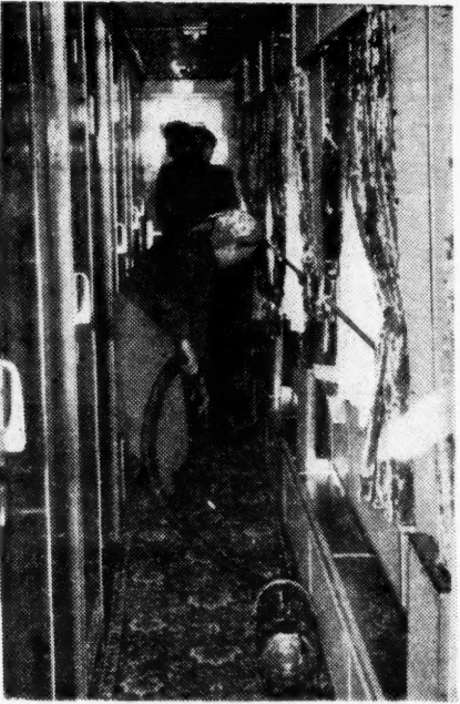
RIDES THE SHINY DIESEL A vacuum cleans the new train

AND THEY OWN IT: Independent Mongolia has under a million people and over 26,000,000 cattle, in a terrifrance and Italy combined. To this predominantly pastoral but well-educated and progressive nation, the new railway is a gift and a boon. It is not a foreign line running through the Mongolians' territory; it is now their property from border to border—680