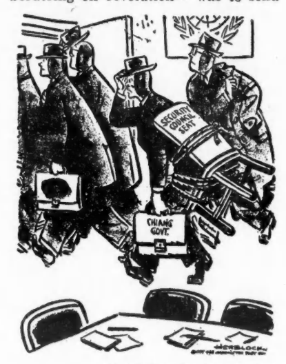
Herblock in Washington Post WILL THE ROPE HOLD?