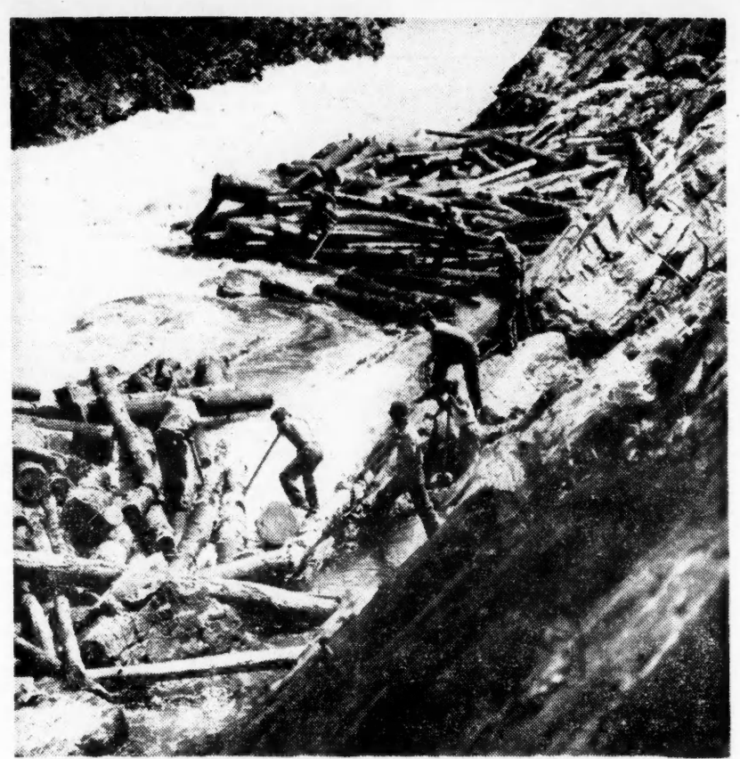
THE GREAT GIVEAWAY: TIMBER, GAS, NICKEL-AND WHAT NEXT?