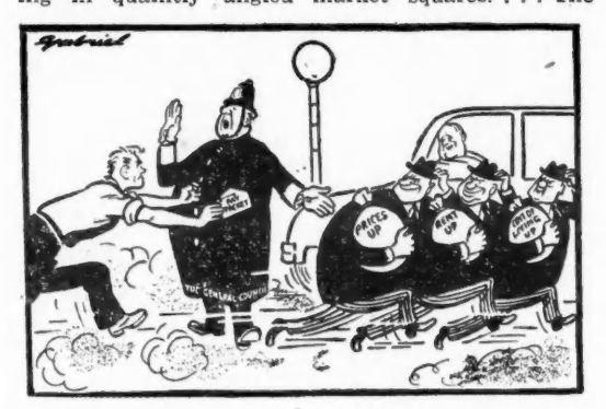
Drawing by Gabriel, London "The time has come for you to stop your mad race, my man!"

Great holes still yawning in mid-city blocks as mementoes of the 1940-41 blitz. . . . Roman remains, 1,000-year-old churches, pub signs pleasantly beckoning in quaintly angled market squares. . . . The