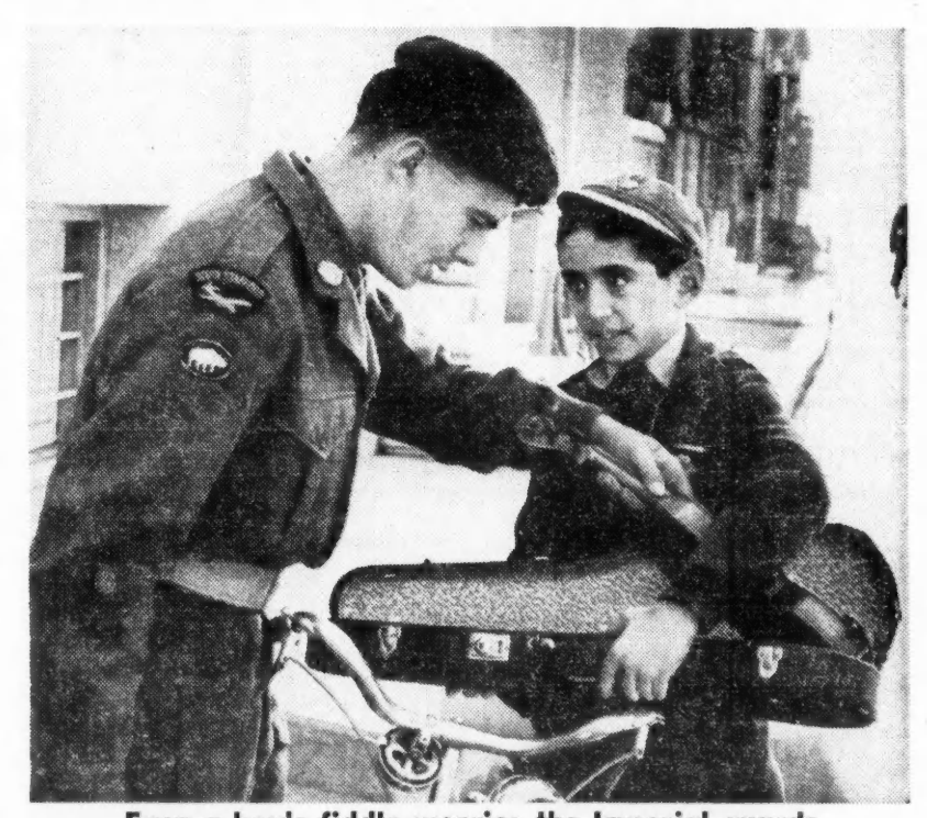
Even a boy's fiddle worries the Imperial guards The scene is Cyprus, where Britain "has created a shambles and called it a base." The Lord Provost (Mayor) of Glasgow has joined MP's in objecting to

the sending of teen-age Scot conscripts to the strife-torn island. The London "News Chronicle" leported a "wave of protest" by mothers,