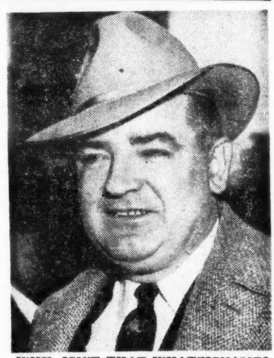
WHY, ISN'T THAT WHATZISNAME? Nobody, but Joe. This is the way looked at a recent N. Y. appearance.

"In view of that fact, I do not understand how the FBI was able to take effective action to 'virtually eliminate' lynching in light of your statement that the Dept. of Justice can act only where federal statutes have been violated. If the federal government was able to act in the same area of lynching in the absence