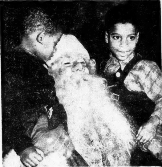
THIS WAS CHRISTMAS IN MOSCOW ather Frost (the Russian Santa) with chil-dren of the "Porgy" cast at a party

Every self-respecting opera composer in history took his librettos very seriously. A composer is great because of his deep interest in real life and people—granted that he can carry this out musically—and this interest shows there as well in the music pretty