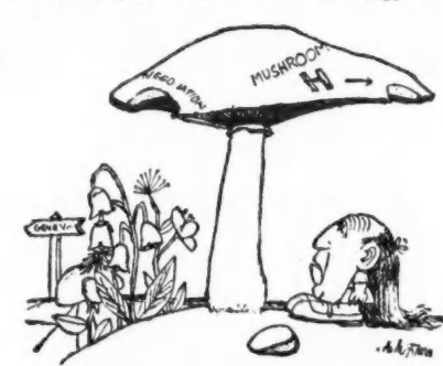
ADENAUER IN WONDERLAND

• His order to his defense minister to re-examine the case for compulsory conscription, of which he has hitherto been an ardent advocate. This move was taken in response to pressure for a smaller professional army. It is rearded also as an attempt to avoid ne logical consequences of disarmament and to counter the strategy of