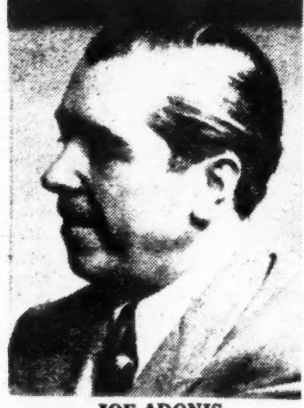
JOE ADONIS Sweet memories of Jersey

GUISEPPE DOTO: The village officials muffled their hurt pride and did not take him down the twisting Via San