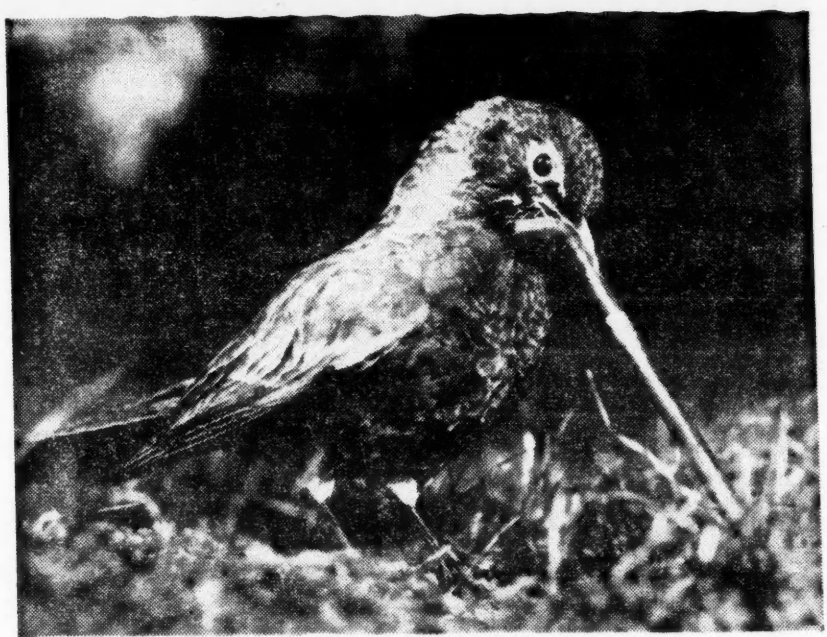
Well, it's Spring