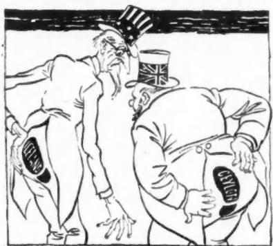
Bidstrup Copenhagen in Land og Polk, SORE BASES

shade of opinion from outright acceptance of Moscow's sincerity to blank skep-