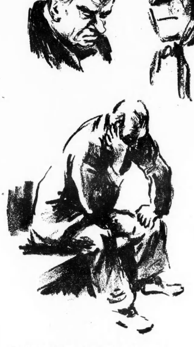
People of all kinds in all moods find their way into the artist's sketchbook.

SOME ARTISTS can be indestructible, though they naturally would rather not have to prove it. Unfortunately, the climate of recent American radicalism has tried its artists' toughness, perhaps unnecessarily. They found themselves in