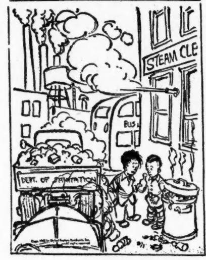
Drawing by Bill Mauldin ottle of fresh air I scooped up in Central Park. I take a whiff from time to time."

THE "ZEALOT": Assembly Speaker Heck R-Schenectady) a few days earlier had attacked Abrams as "unfit personally" to