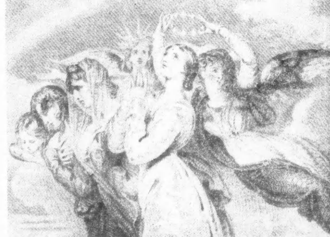
"GUARDIAN ANGEL" - A Victorian Print.