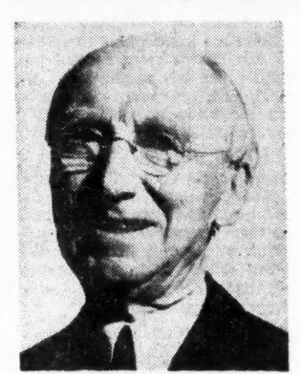
HARRY F. WARD Tireless warrior for decency

BIZARRE: Next day, May 3, Sen. Carl Hayden (D-Ariz.), chairman of the House-Senate Committee on Printing, denounced the injunction and ordered the