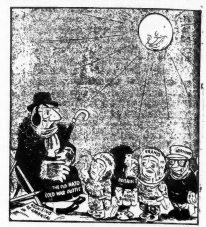
'Phew! Shouldn't we change into more suitable for the changed temperature?"