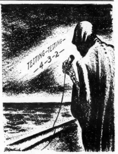
Fitzpatrick in St. Louis Post Dispato