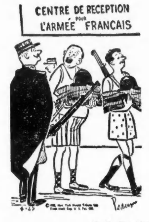
"Honest, I'm a tourist! I thought I was signing up for a Paris bus tour."

(1) Mollet leaves for the Soviet Union thoroughly briefed. His information on the intentions and dispositions of the Soviet partners to his Moscow talks is due to various sources, all first-hand.