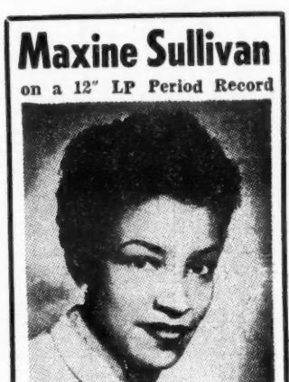
and Jaxx Songs $3.50 ppd.