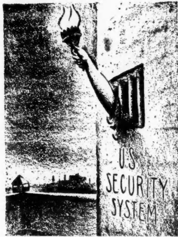
DARKNESS AT NOON