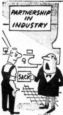
"Well, so long, partner!"