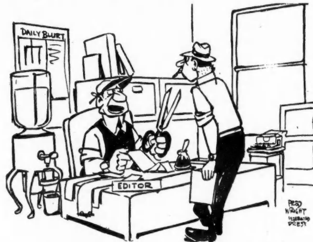
"Sure you have freedom of expression . . . Write anything you think our advertisers may like."

Did I say all delegates? They didn't send one to me. With most other delegates I believe (and said so from the rostrum) that no press in the world can point with great pride to its record in recent years, and that professional organizations have a duty to protest against all persecutions of journalists by all governments. But I was one delegate for whom the source of the stinkbombs was just too painfully obvious.