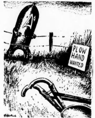
Fitzpatrick in St. Louis Post-Dispatch Time he was making himself useful

CHALLENGE TO NATION: The work of the salvaged by-products does not end even here. For when the cooling off period ("decay of the radioactivity") reaches a safe point, the spent fuel elements can be reclaimed and separated from the still remaining low-intensity radioactive materials, which can then be