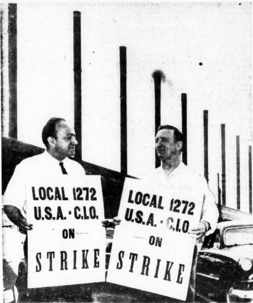
STEEL SHUTS DOWN

Inventories high; companies tough; Washington hands-off; workers strike