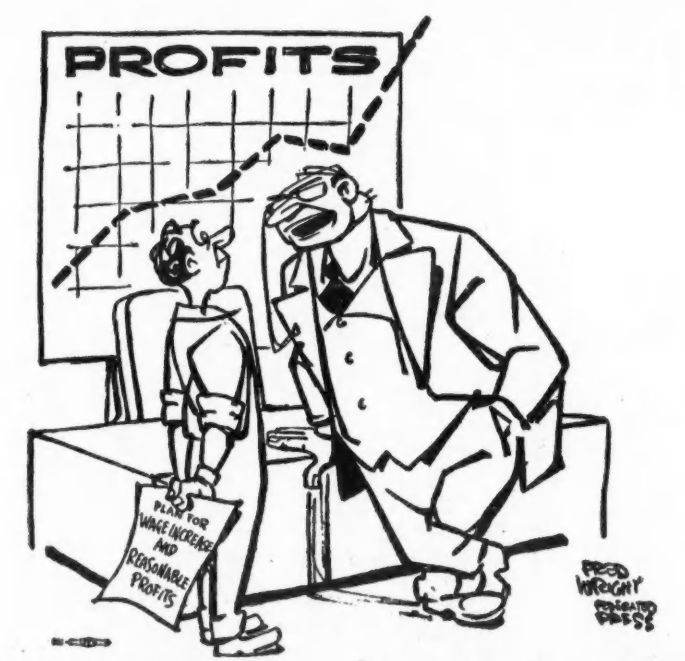
. . And what makes you think we would be satisfied with reasonable profits?"

don't see the same thing come here." When the pinch comes it will mean the toughest test yet for the AFL-CIO. If Big Steel wins, it can hog-tie its workers for five years and install automation on the boss' terms. The stakes are high for all U.S. labor and industry.