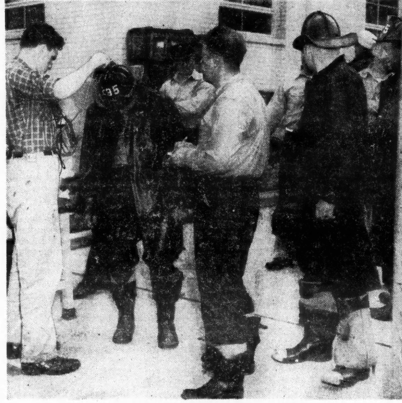
THE NEW ERA COMES WITH A CLICK Fireman at atom blast is checked with geiger counter.

AEC 'REASSURES': But the peril was not alone in the plant where nine work-ers were injured from the blast and fire. The "radiac" unit set out geiger coun-