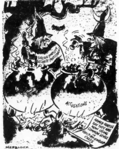
"You using a pinch of salt in your recipe, dearie?"

Rogers is 49, an Air Force staff sergeant in World War II, and a painter whose